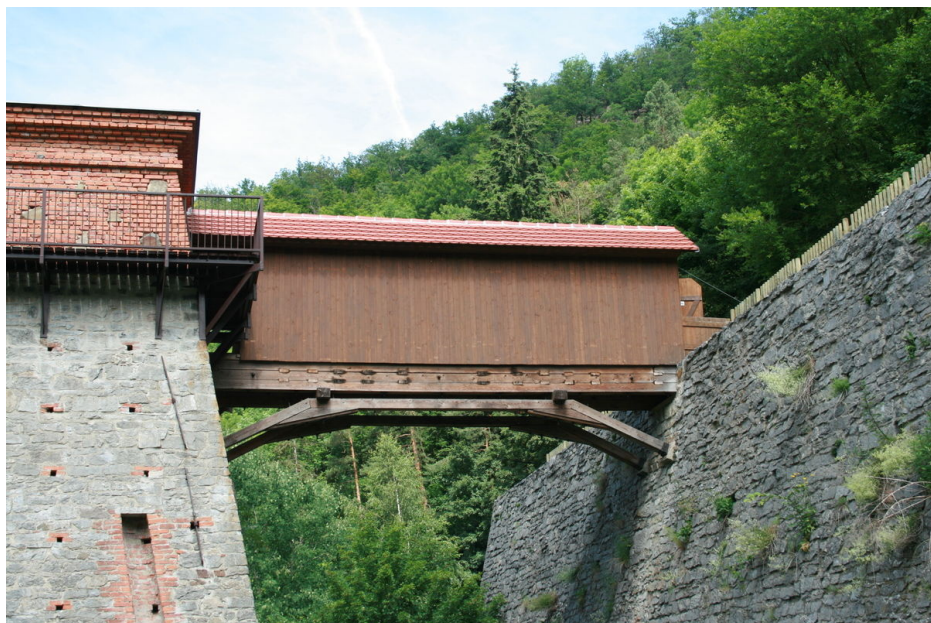
Ramp of the Františka blast furnace. Photo K. Sklenář, 2009.