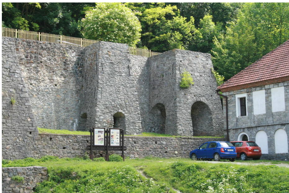
View of the backfill ramp, a pair of lime kilns and the administrative building. Photo K. Sklenář, 2009.