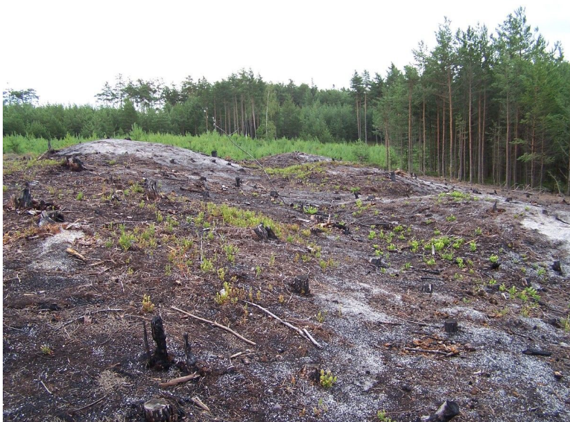
A barrow after forest fire.