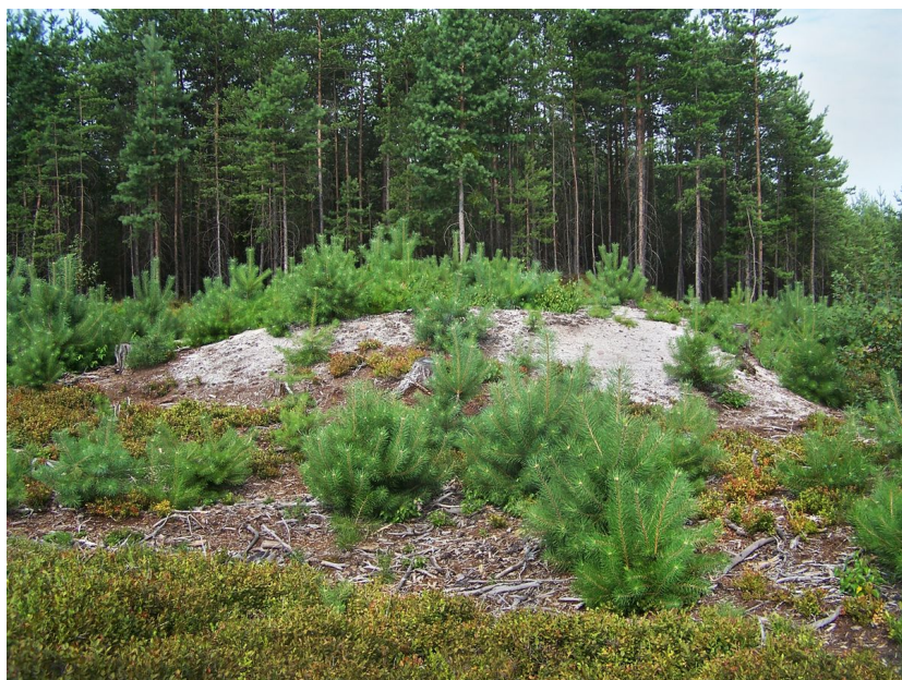
A barrow with renewed forest.