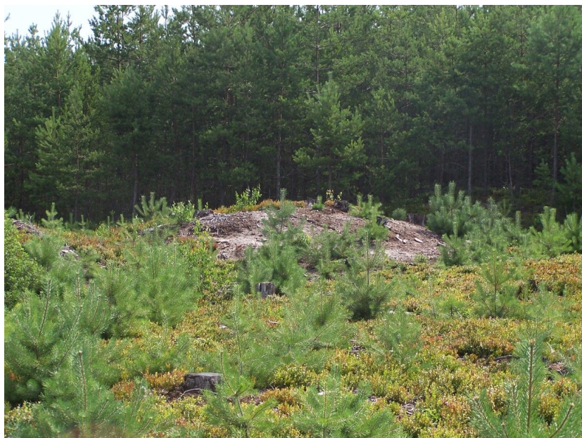
A barrow with renewed forest.