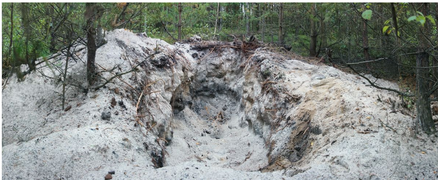
Barrow Nr. 28, destroyed by illegal excavations.