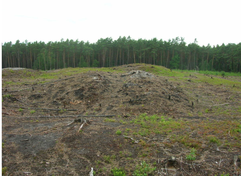
A barrow after forest fire.