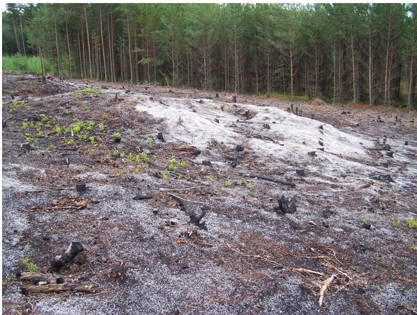
A barrow after forest fire.