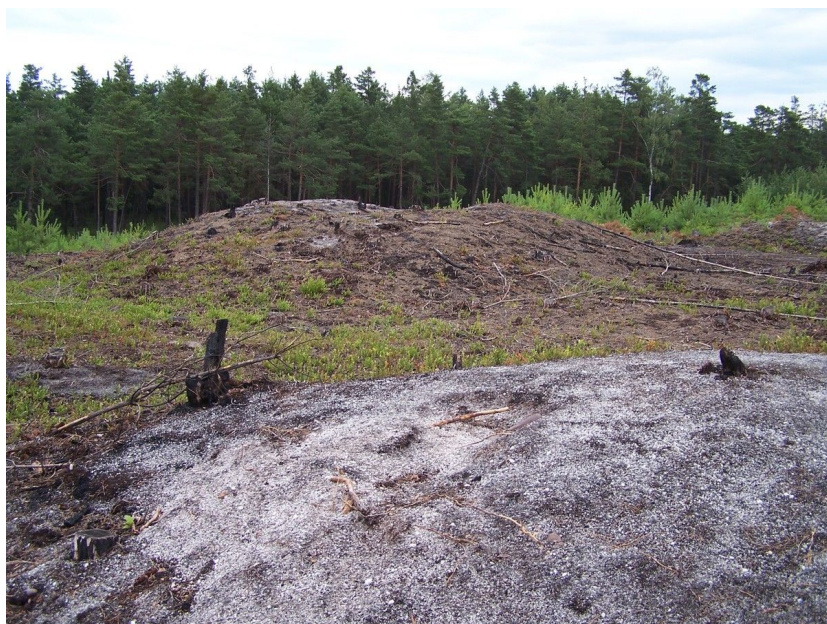
A barrow after forest fire.