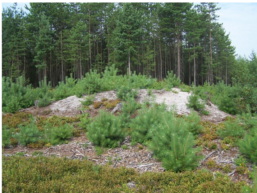
A barrow with renewed forest.