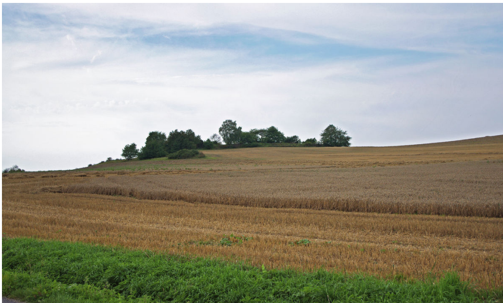
View from southeast in late summer.