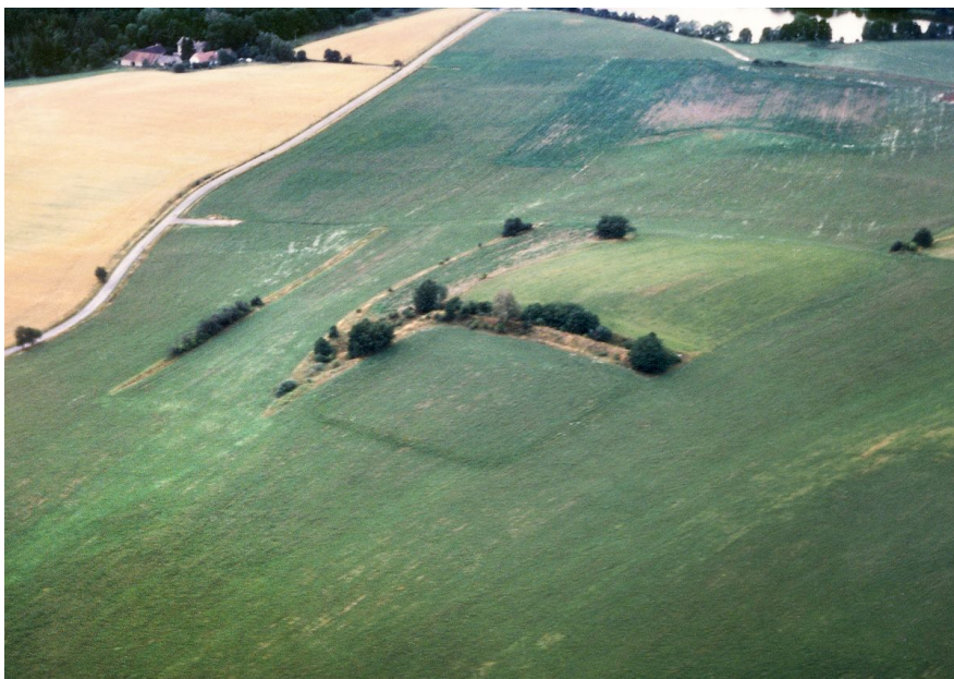
Aerial view with the so-called crop marks.