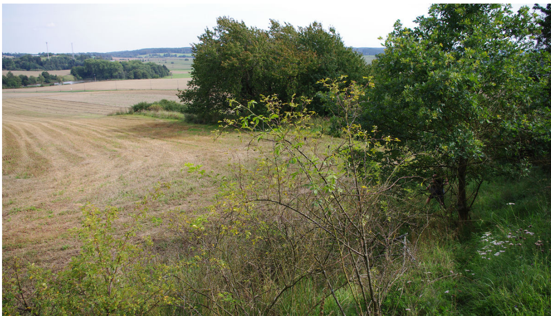
Inner area of the quadrangular banks.