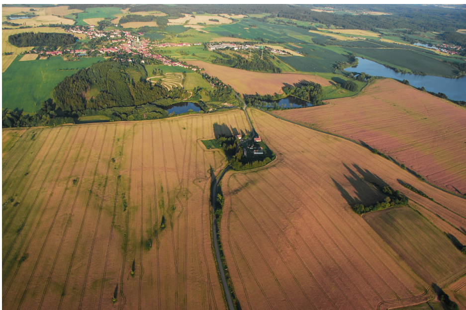
Aerial view – banks are at the bottom, right.