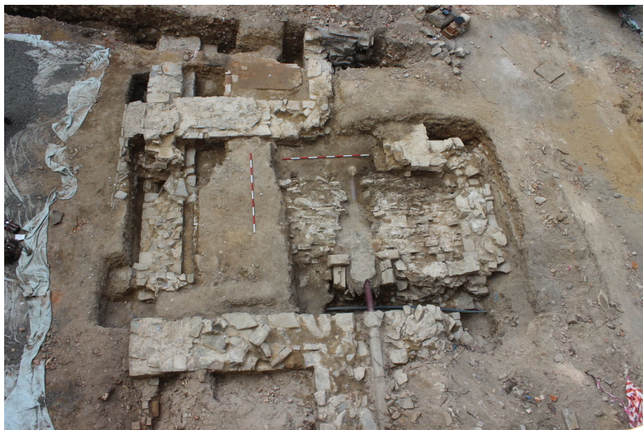
Remains of the castle gate with later added vaulted cellar.