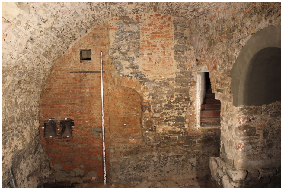
Basement of the first core of the castle with barrel vault and later arcade.