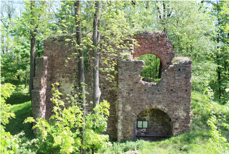
Remains of the walls of the residential quarters from the Renaissance residential building from the south-west. Photo M. Zezulová, 2015.