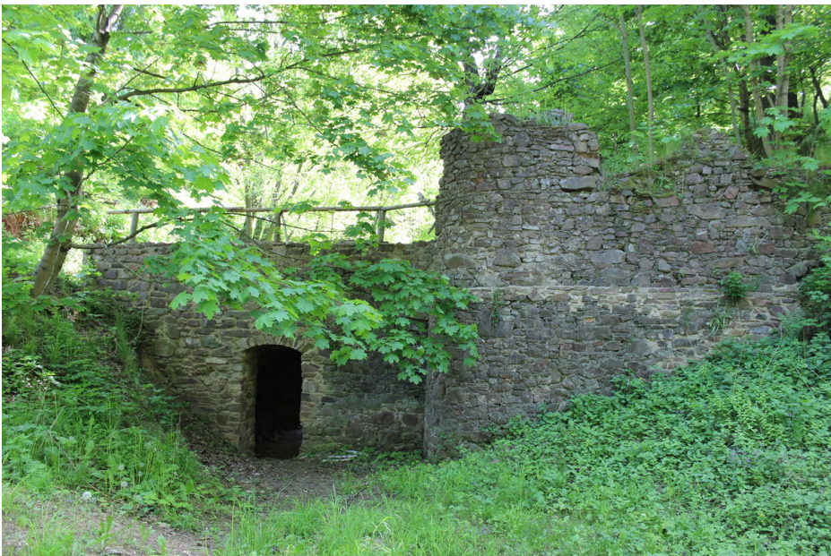
Fulštejn Castle, entrance corridor with bridge. 2015.