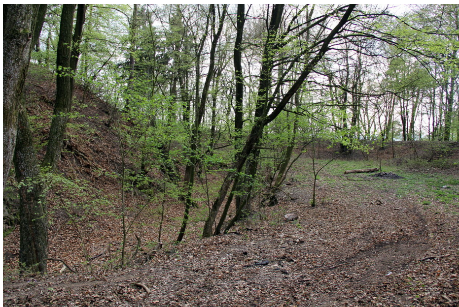
View of the bastion with parts of the ditch and earthwork.