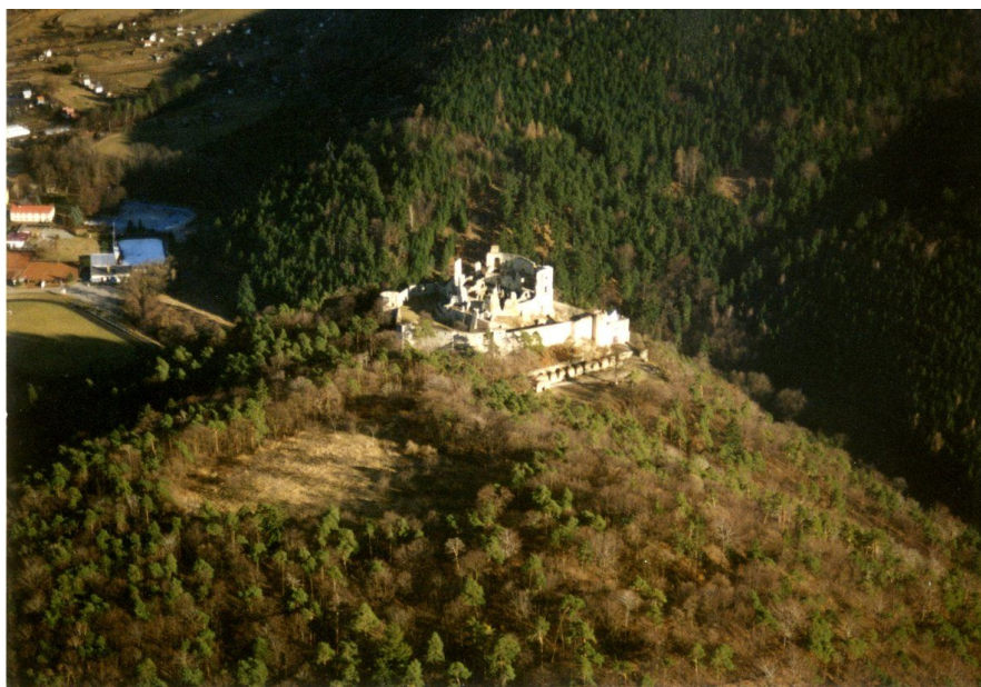
Aerial view of the castle from the west.