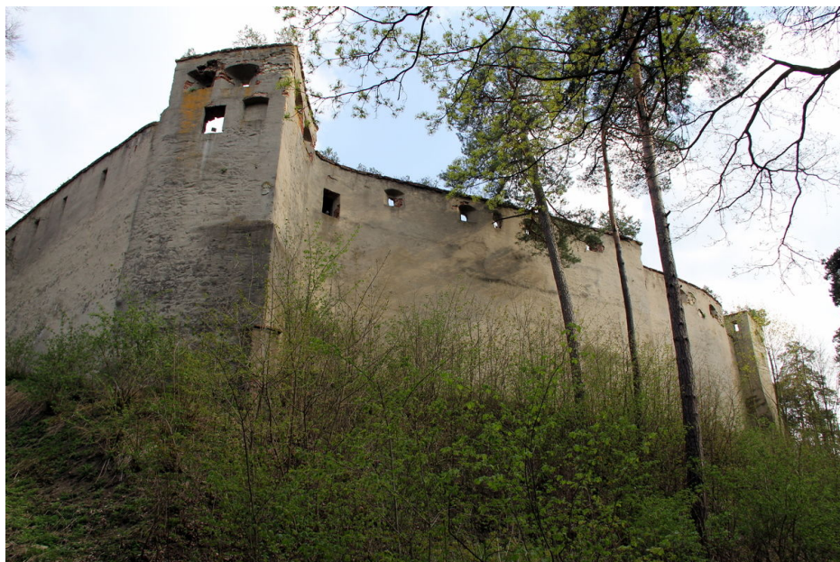
View of the mantlet wall.