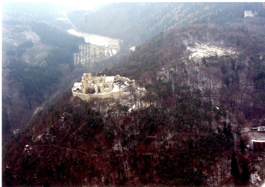
Aerial view of the castle from the south-east.