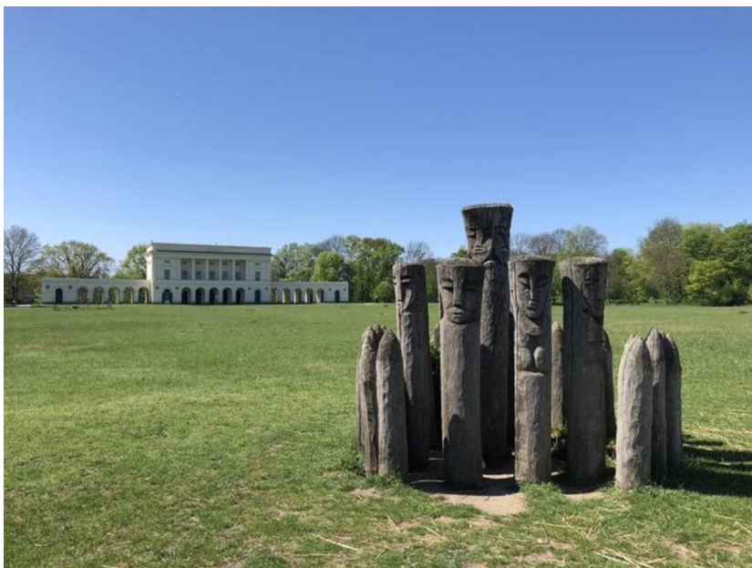
Reconstruction of a pagan cult area.