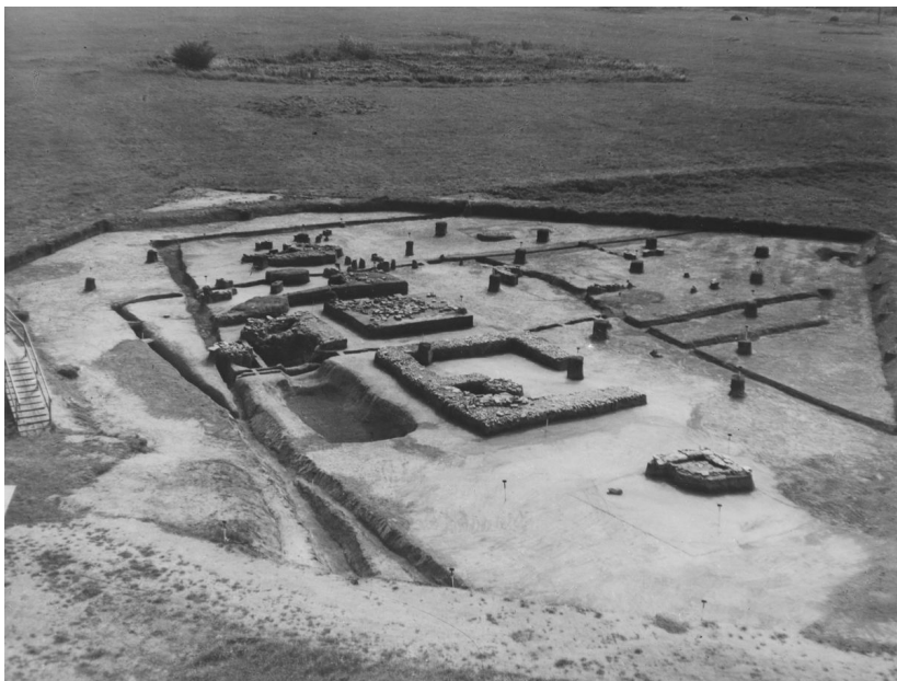
Archaeological excavation in 1967; remains of stone foundations.