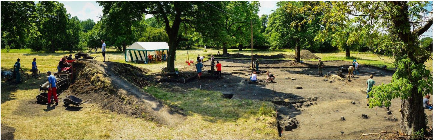
Archaeological excavation in the area of the north-eastern suburb in 2018.