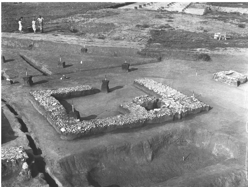
Archaeological excavation in 1967; remains of the stone foundations of houses.

1967, M-FT-101503100