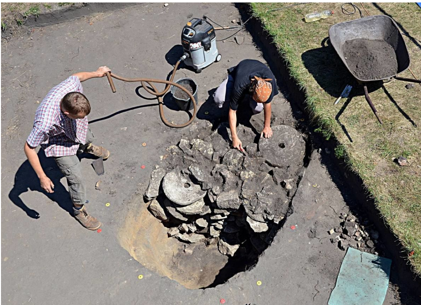
Archaeological excavation in the area of the north-eastern suburb in 2013.