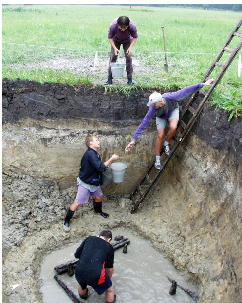
Archaeological excavation in Lesní hrúd field conducted in 1999–2003.