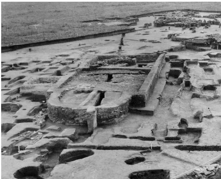
Archaeological excavation of the remains of the fortification in 1967.

Photo M. Havelka, 1967, Archive of the AIB, M-FT-101503100