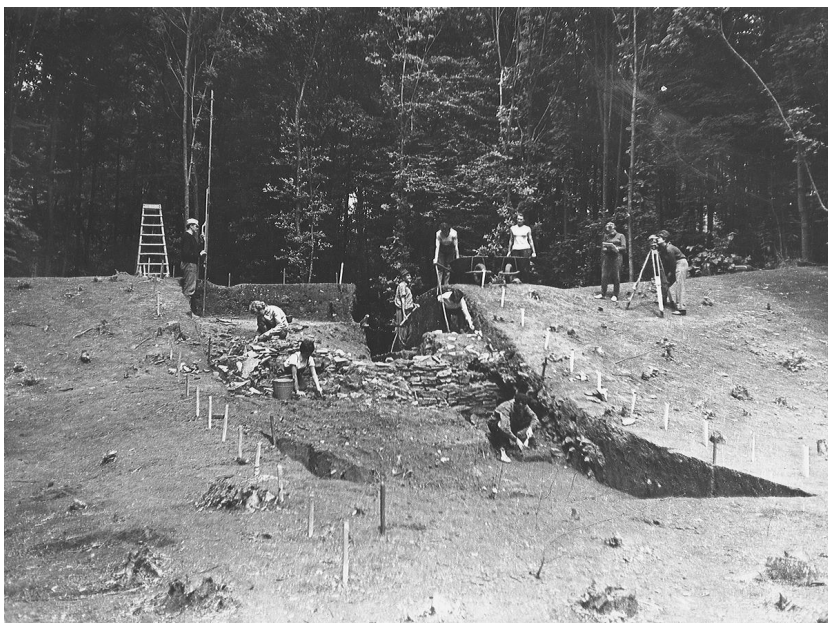
Archaeological excavation in 1964: magnate court with the church.