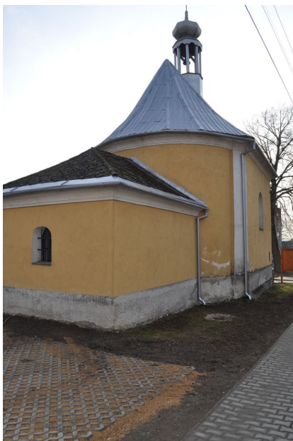
Břevenec, Chapel of St Anthony.