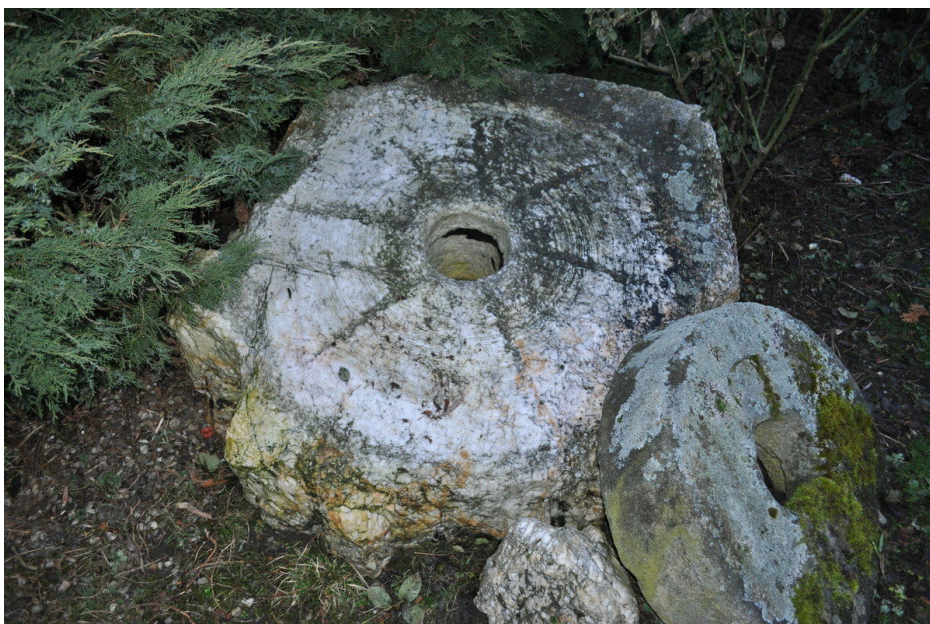
Dolní Dlouhá Loučka, medieval grindstone from the ore mill.