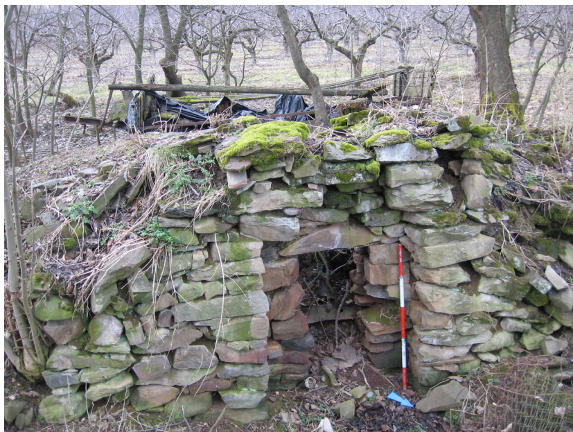
Navrátilova furnace in Blažov, village backyards of the farm No. 17, view from the north-east.