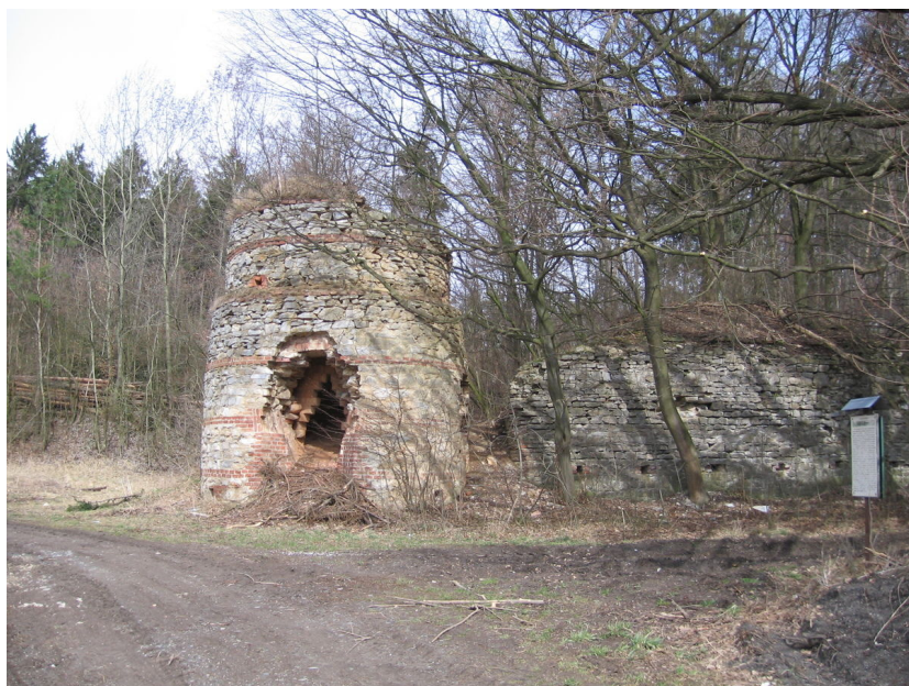
Limestone shaft mine from 1931 in Kovářov, Rachava field, current state, view from the south.