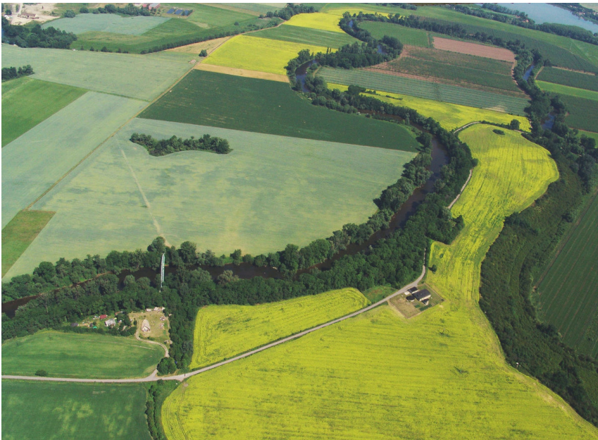
Aerial view of the open-air museum and meanders of Eger river.