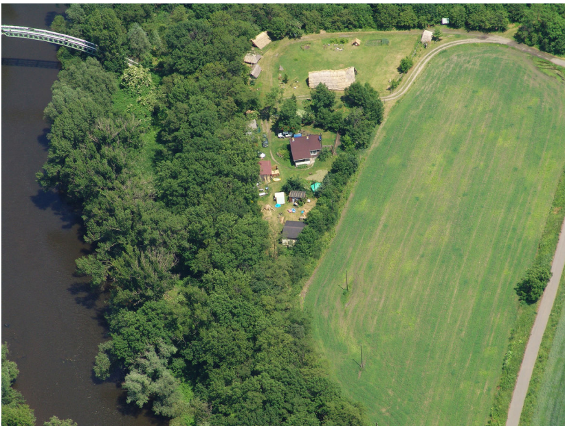
Aerial view of the open-air museum.