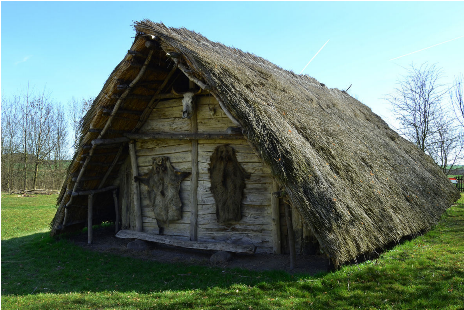
Rear wall of the Neolithic long house covered by an animal skin.