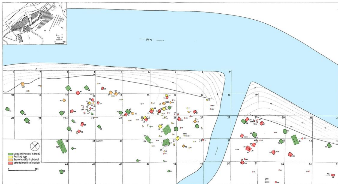
Site plan with Early Medieval features.