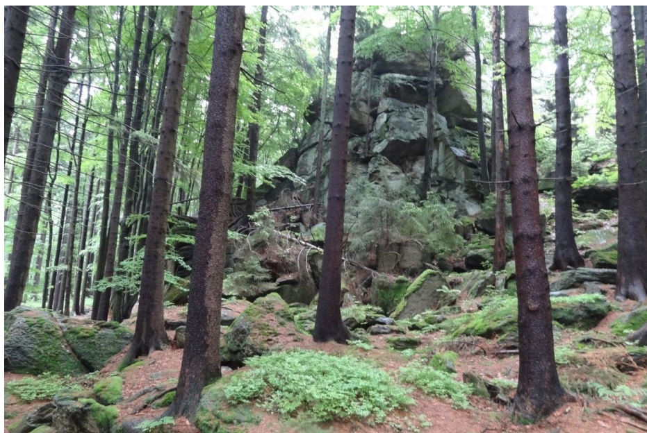
The highest rock in the north-western part of the area.