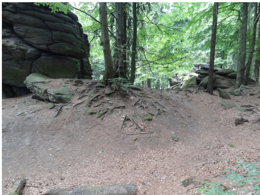
Short stone rampart between the rocks in the south part of the area.