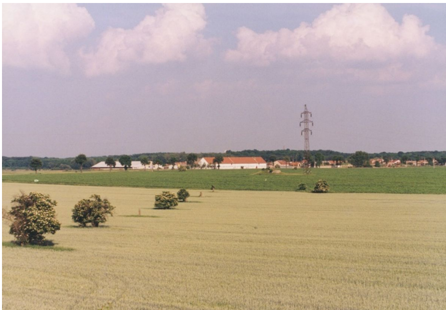
View of a temporary Roman camp from the north-west.