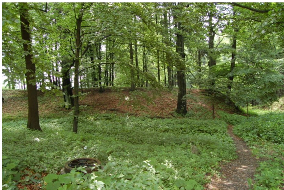
The earthwork in the south-east part of the hillfort; seen from the north. Photo P. Vachůt, 2007.