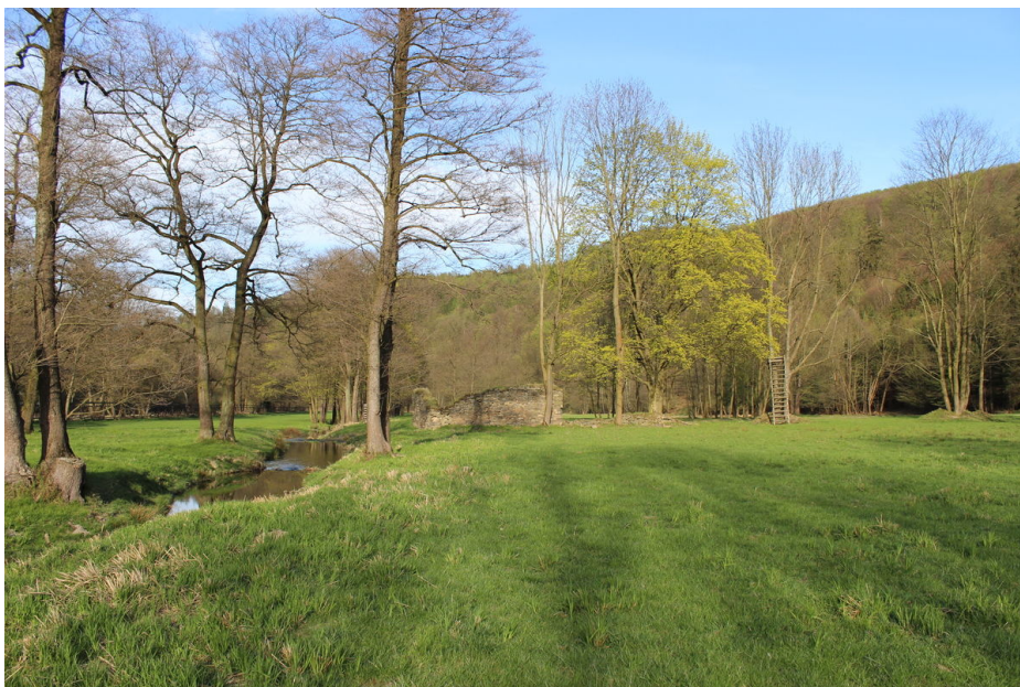
Remains of the Rozsocháčský mill with mill race.