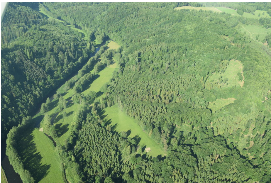
The Moravice River valley with visible mill race.