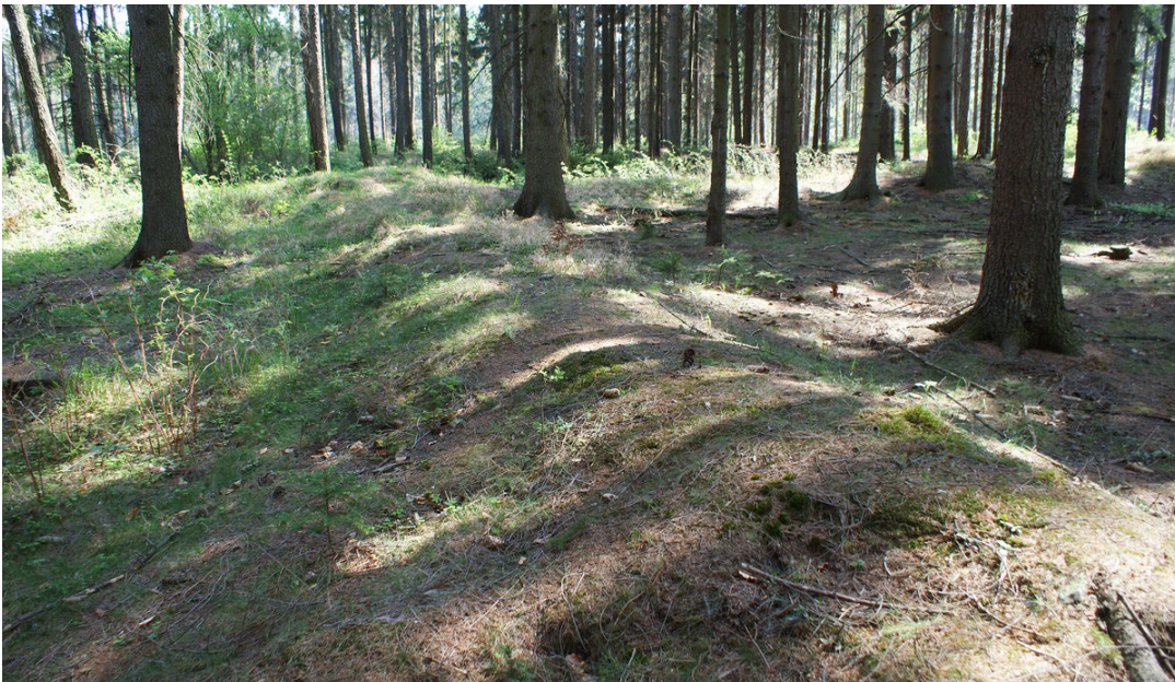
Homestead Nr. 14, walls.