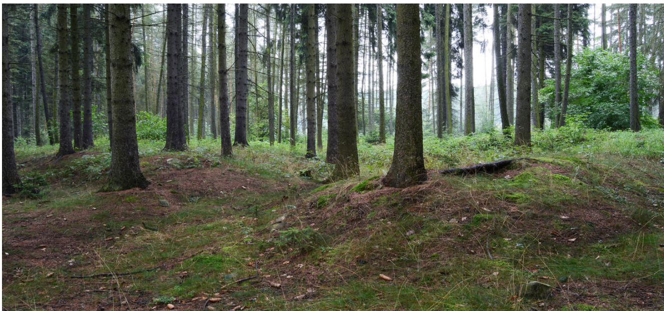
Surface in the deserted village.