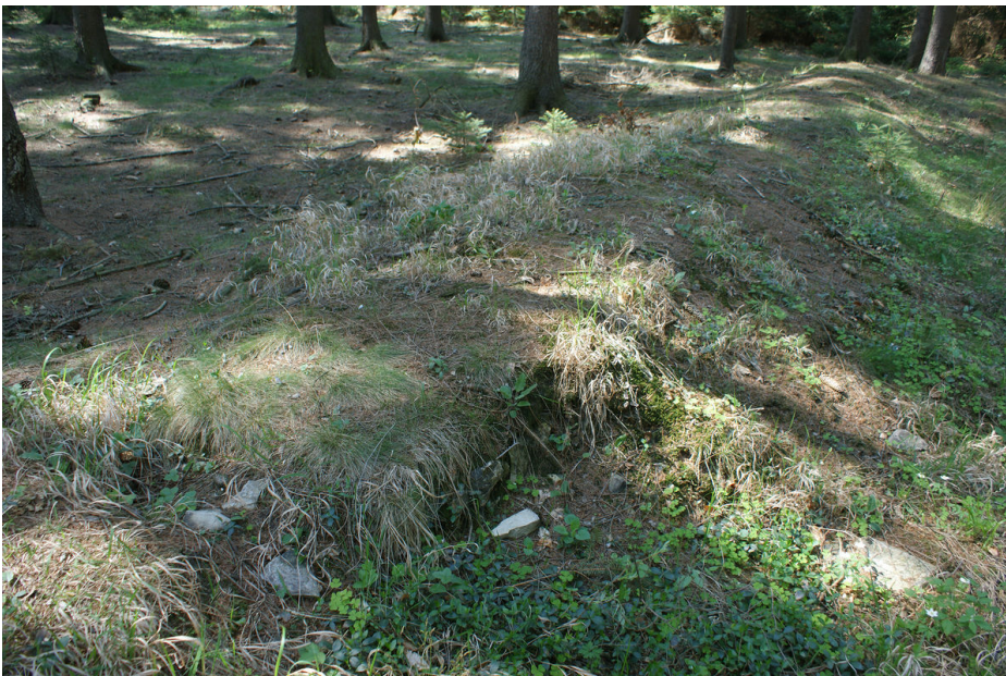
Homestead Nr. 14, walls.