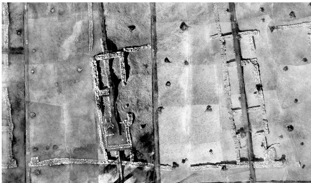
Photoplan of houses Nos. 1 and 2 during archaeological field work. Archives of the IoA, PY000228019.