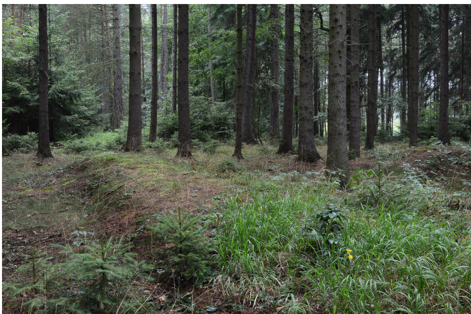
Medieval deserted village ruins.