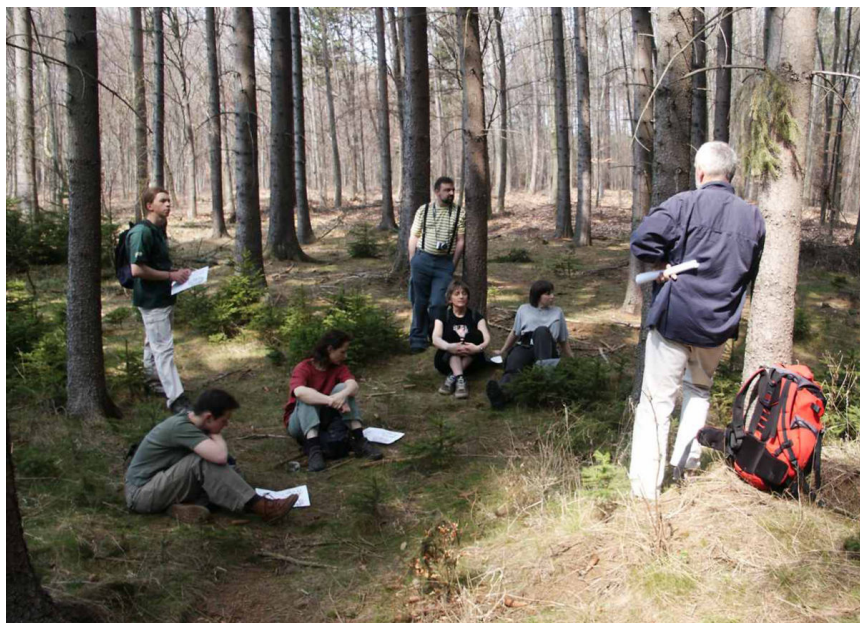
A visit on the site.