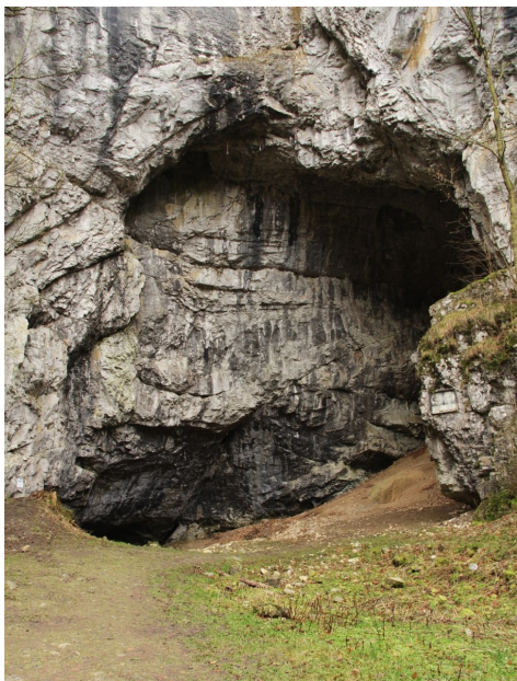
Detail of the renovated cave entrance.