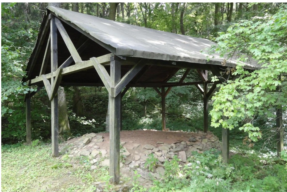
Pottery kiln in the south-south-eastern corner of the manor house.