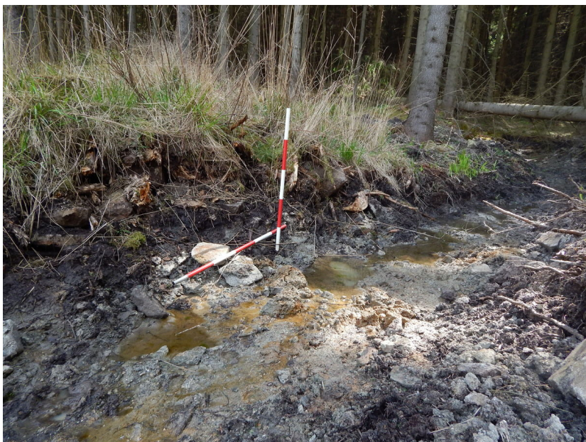
The results of forestry at the site.