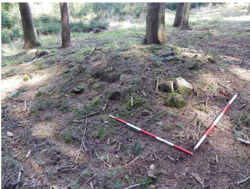
Debris of a building of the deserted medieval village.