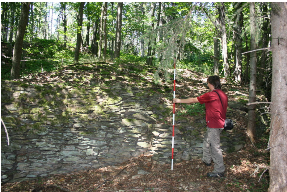
Agricultural building in the surroundings of Ďáblův kopec.