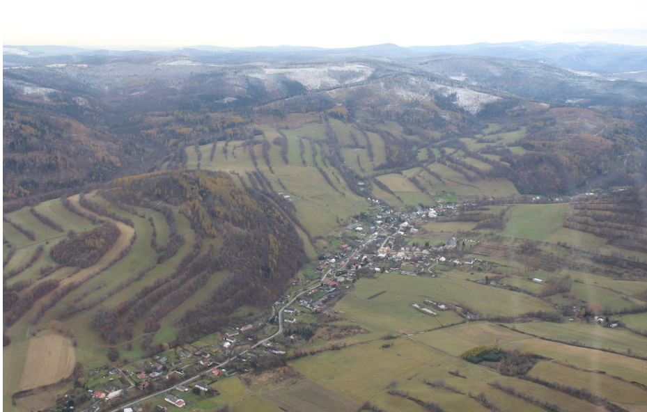
Physical relief in the surroundings of Janov, aerial view from the north-east.