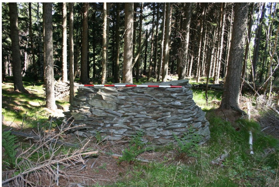
Circular building on the slope of the Velká Stříbrná hill.