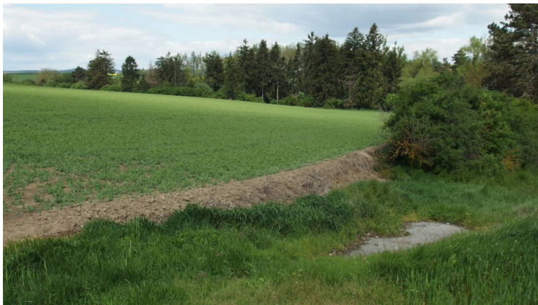
View of the hillfort area from the east.