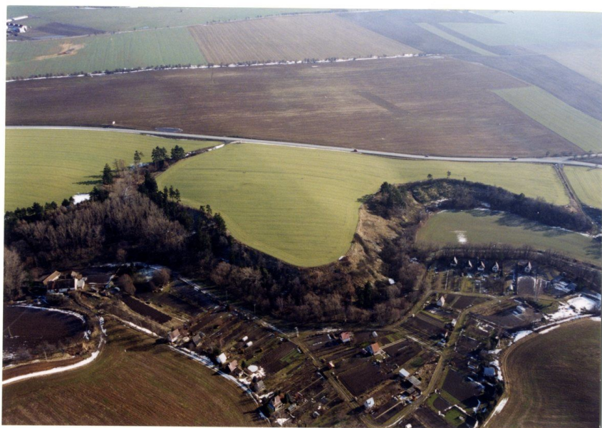
Aerial view of the hillfort from the west.