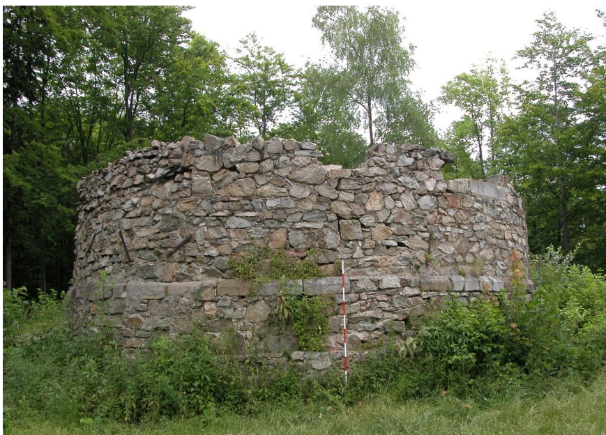
The bergfried from the south-west.