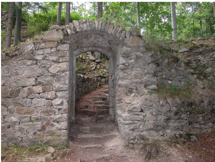
Gateway to the zwinger.