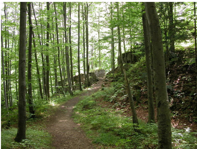
Access platform of the gatehouse.