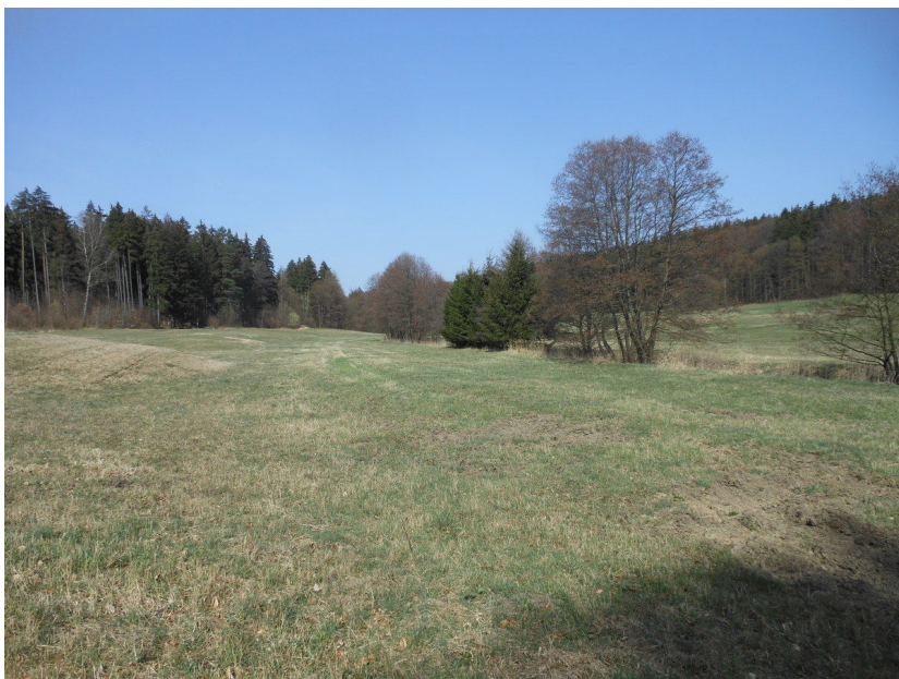
View of the site from the south-east.