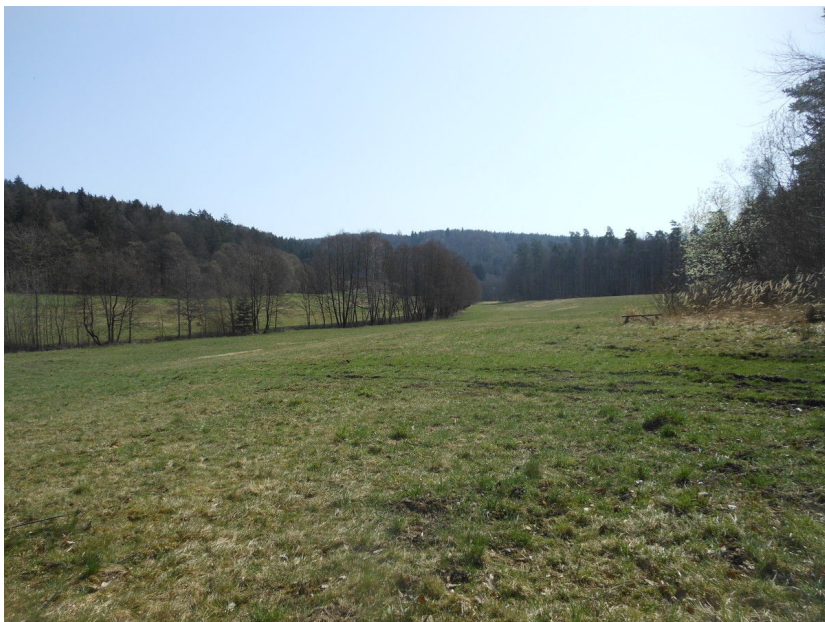
View of the site from the north-west.