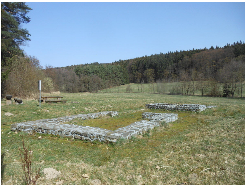
Presentation of the foundations of farmstead No. XI.