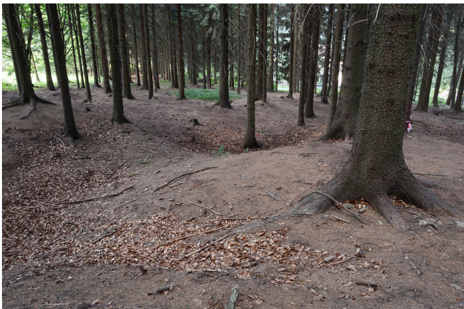
Former mining features.