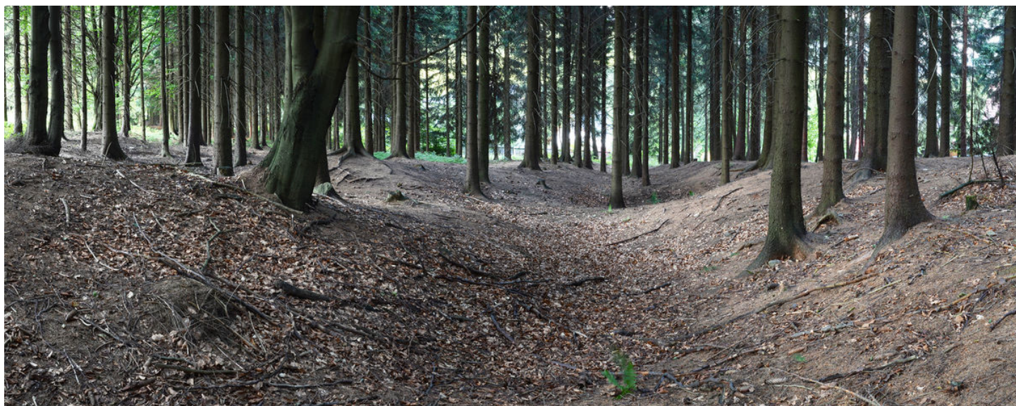
Traces of previous mining activities visible on the surface.