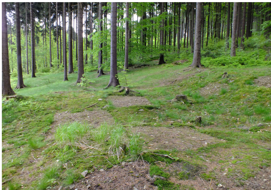
Location of P. Šída's excavations.