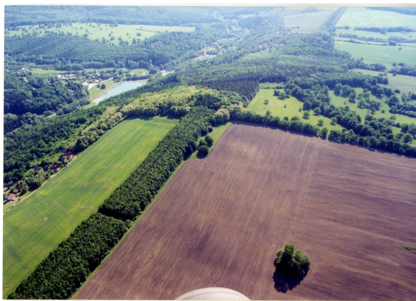
Aerial view of the hillfort.