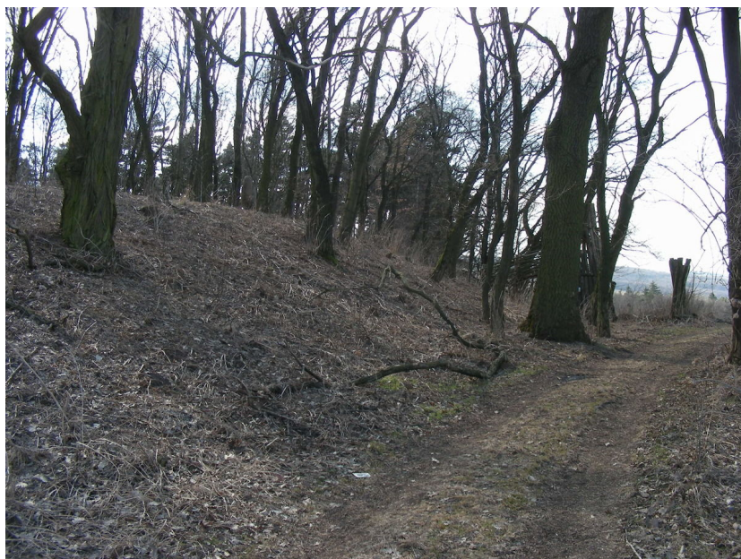
View of the earthwork of the hillfort.