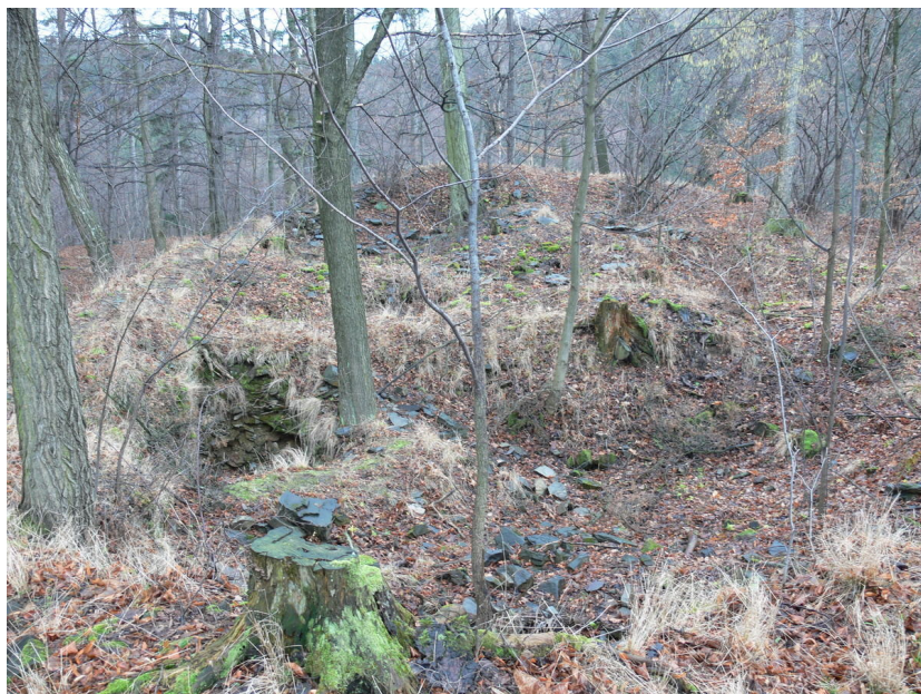
Remains of the buildings in the front castle.