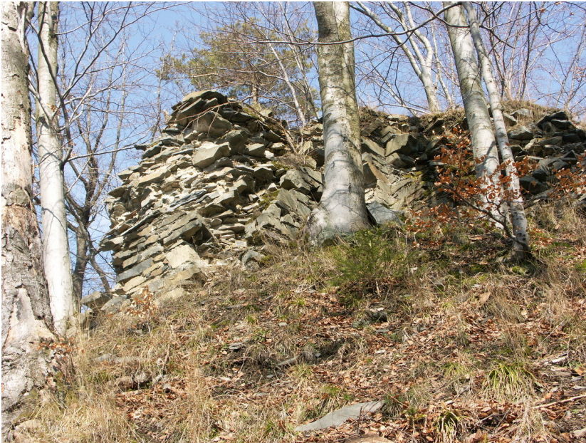
Front wall of the rear castle with the jambs of the gateway and a prismatic tower situated further up.