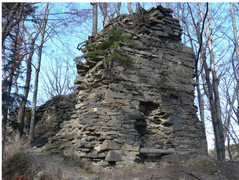
Rear castle: inner face of the west wall of the residential house with partially preserved window reveal.