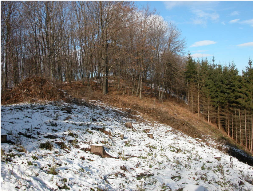
Northern part of the fortified area, view of the east slope from the south.