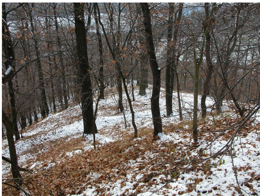
North part of the rampart on the west slope, view from the north-east.