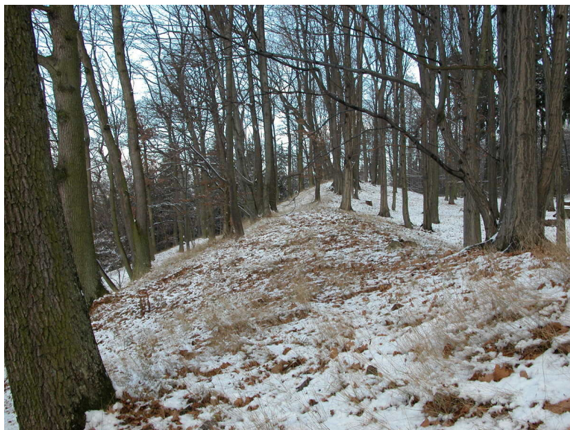
South-western part of the rampart on the west slope, view from the south-south-east. Photo H. Dehnerová.