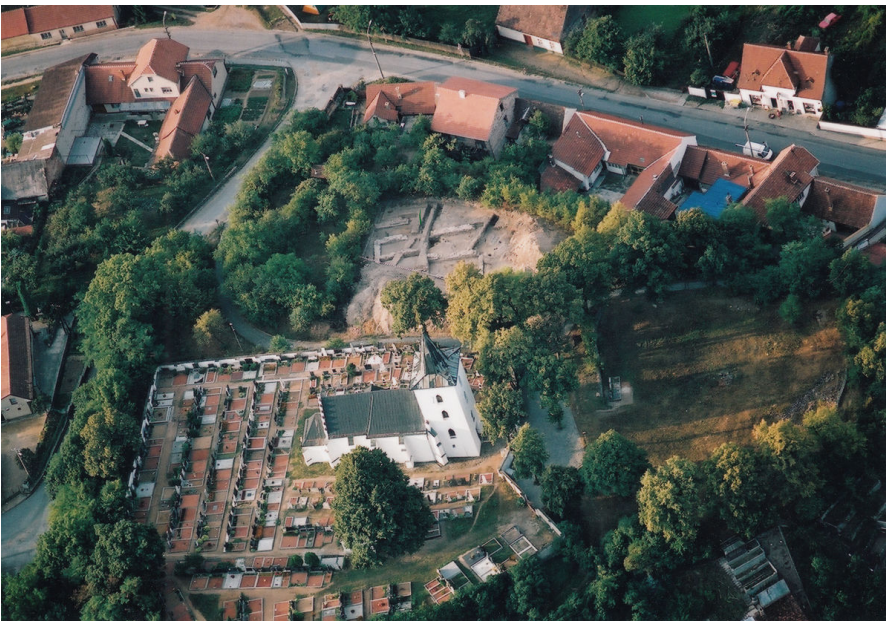
Aerial view of the spur with a church, remains of the castle and excavation in the foreground.