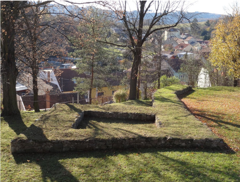
Presentation of the defence walls and a tower.