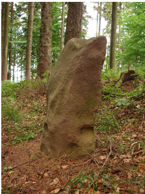
Erected stone at the peak of the hillfort.