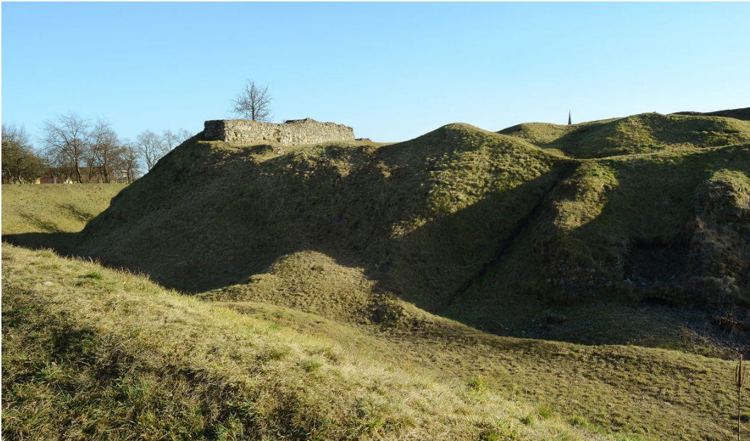
Castle core with a moat.