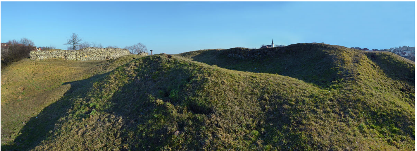
Ruins of the castle core.