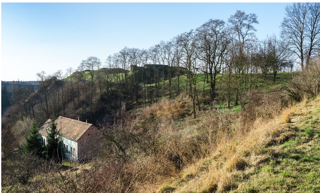
Castle, taken from south-east.