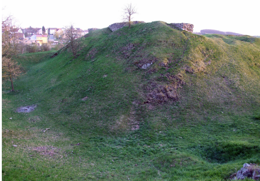
Ditch dividing the castle core from its bailey.