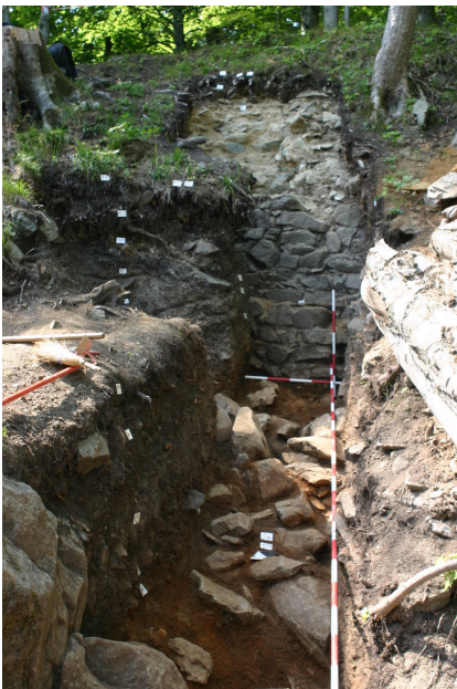
Remains of the castle wall during the archaeological excavation in 2012.