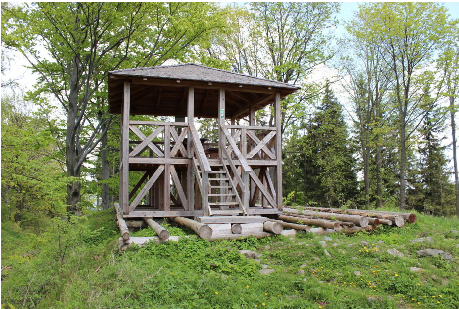
Lookout Tower at the place of the residential tower.