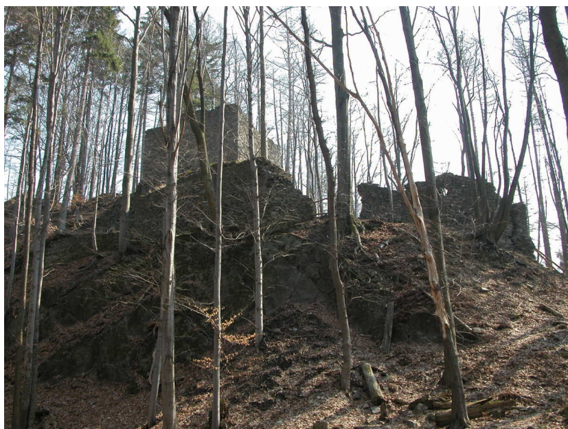
Overall view of the upper ward from the west.