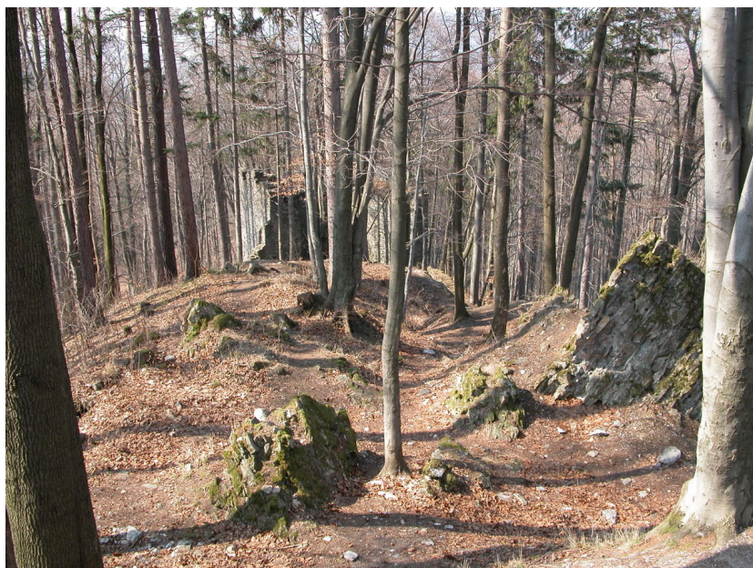
Upper ward from the east, stone blocks of the tower walls in the foreground.