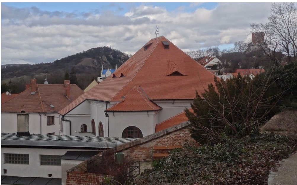
Jewish quarter with the Horní (Upper) Synagogue.