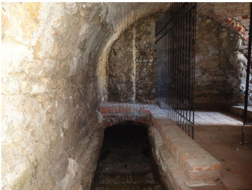
Reconstructed Jewish ritual bath.