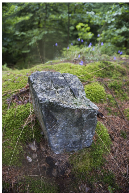
Boundary stone with an incised cross.