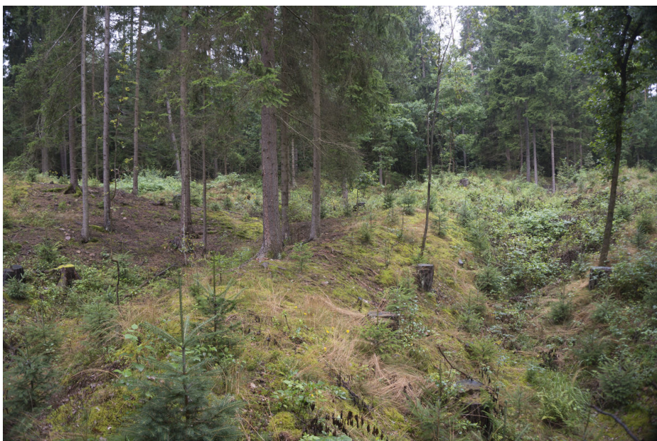
Remains of hollow ways or water channels.