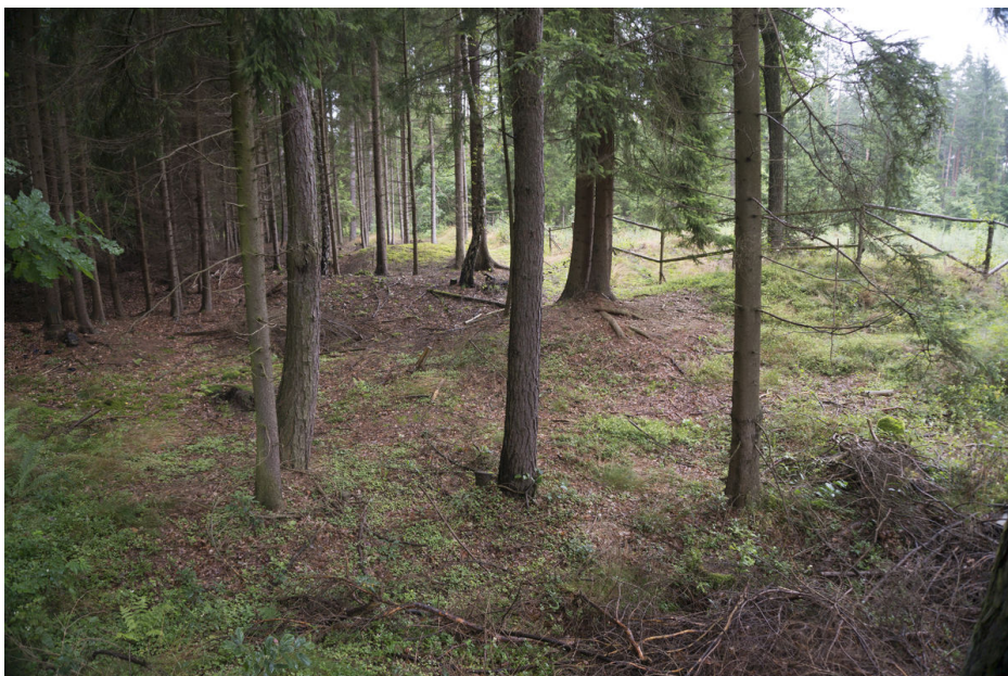
Western part of the area with remains of Early Medieval mining activities.