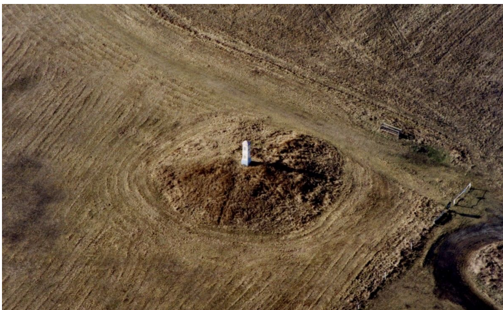
Aerial view of the Mohelno Serpentine Steppe with barrow and wayside shrine of St Anthony.