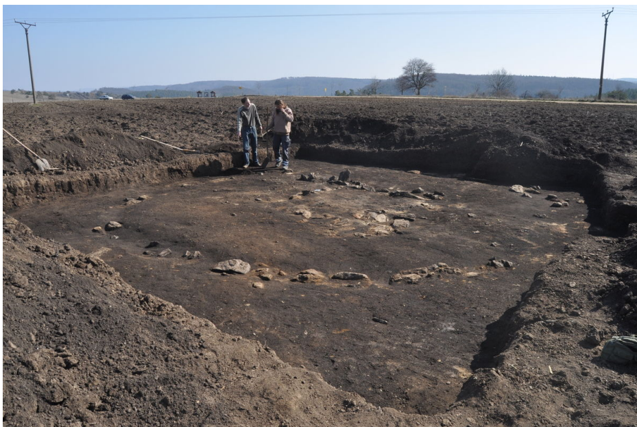
Stone construction of the barrow, inside with stone chamber divided by a wall for two cremation burials.