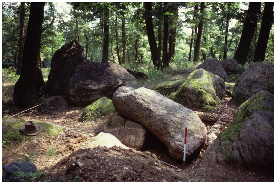
Stone stele, view from the north.