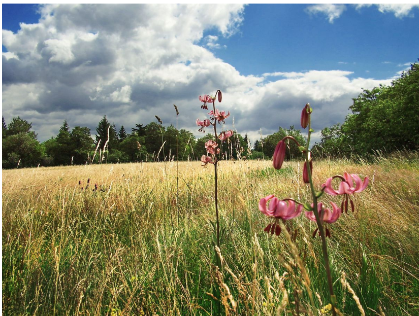
Meadow at the hillfort with the protected Lilium martagon , Turk's cap lily.