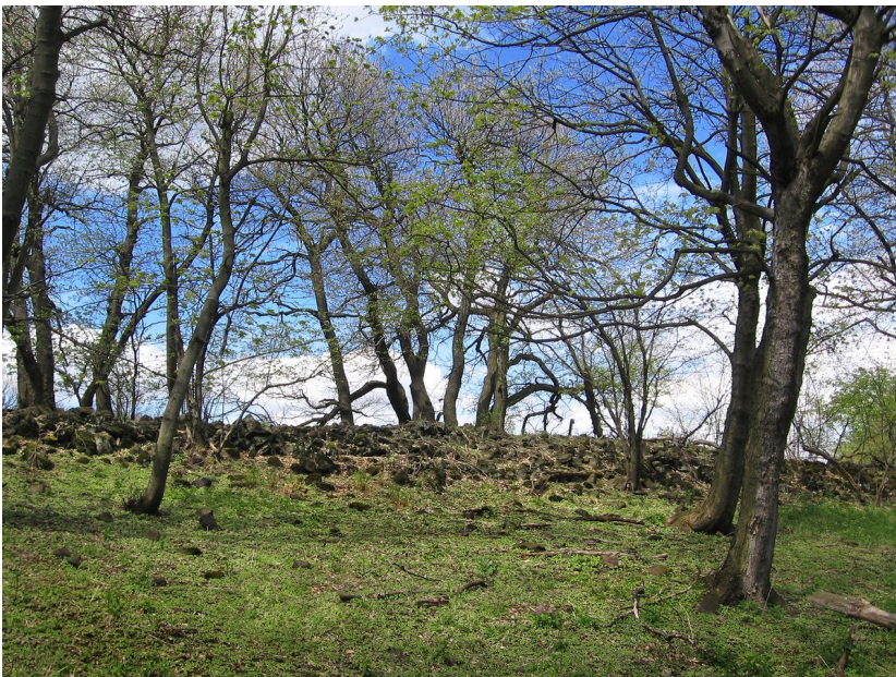
Stone banks of the hillfort.