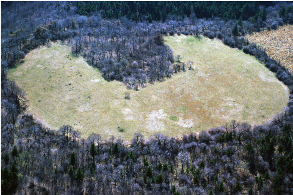
Aerial view of the hillfort.