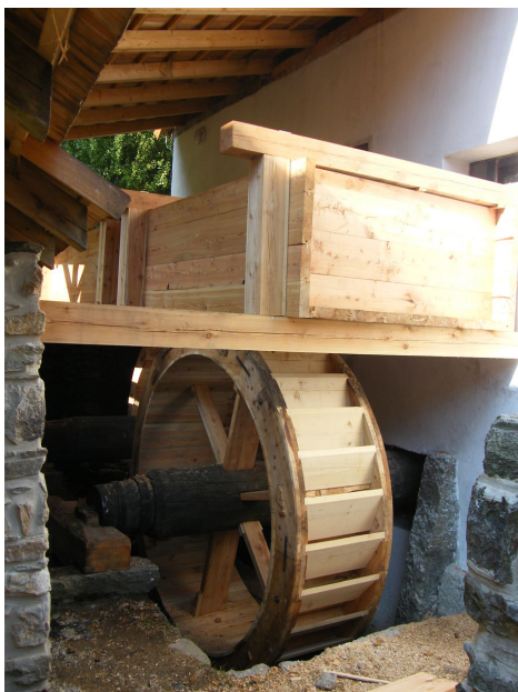
Overshot waterwheel, view from the south-west.