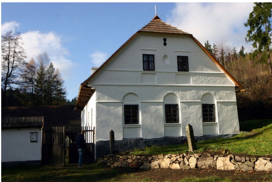
Front view of the relics of the former mill.