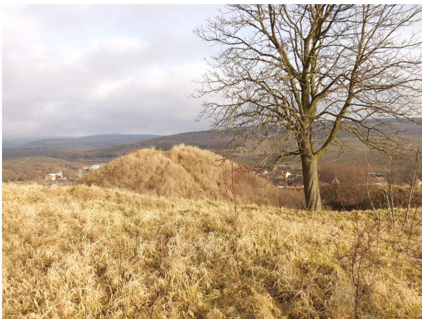
View of the upper ward as seen from the lower ward.