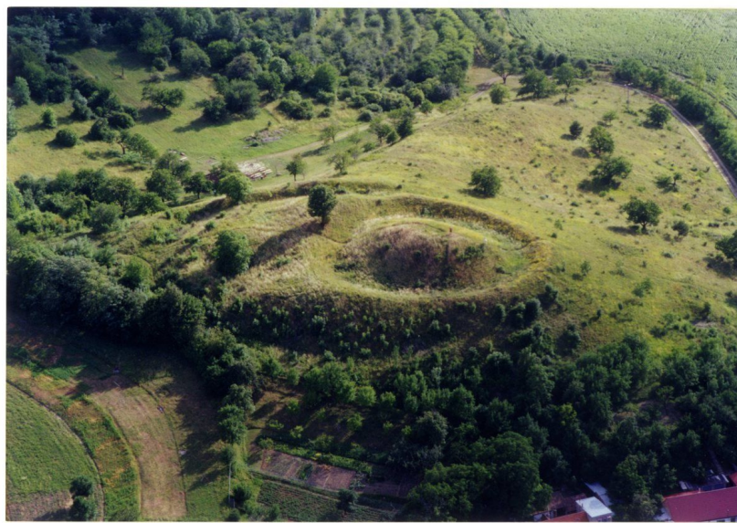
Aerial view of the site.