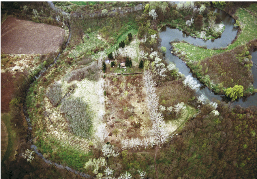
Aerial view of the upper ward of the hillfort and old meander.