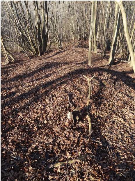
Outer earthwork of the hillfort.