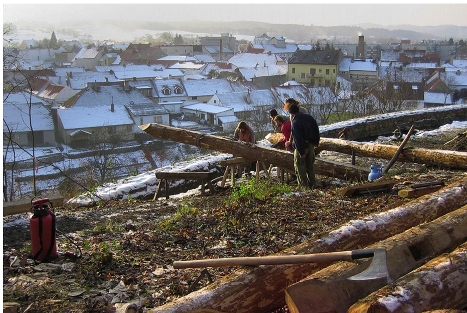
Building of the Early Medieval rampart reconstruction. Photo Z. Příbyl, 2005.