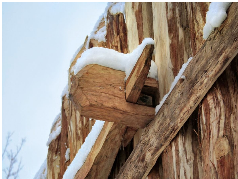
Palisade in the reconstructed Early Medieval rampart in the Netolice archaeological open-air museum.