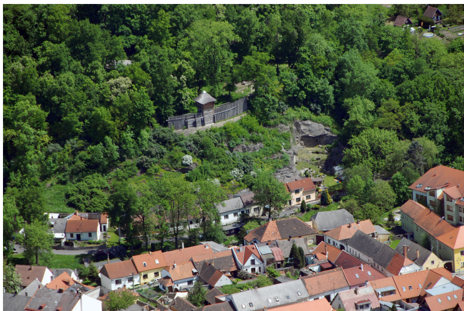
Aerial view of the hillfort.