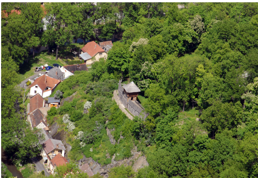
Aerial view of the hillfort.