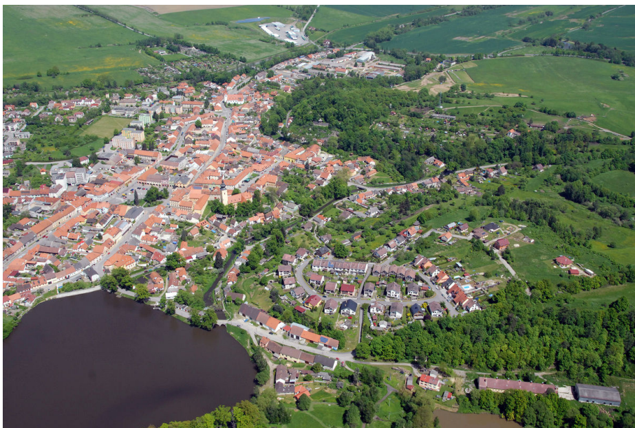
Aerial view of the city of Netolice with the hillfort.