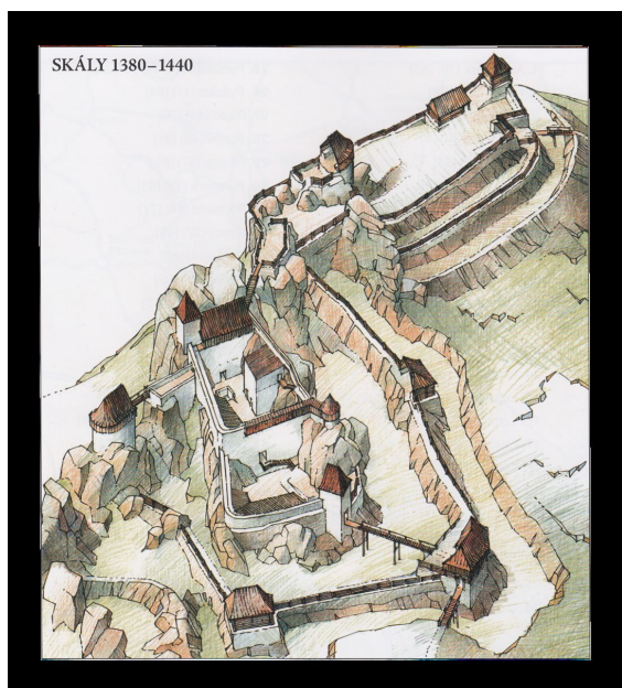
Reconstruction of the appearance of Skály castle in 1380–1440.

After M. Plaček and P. Šimeček, Archieve NPÚ UOP Prague.