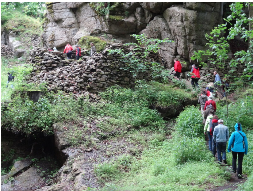
Archaeological field trip to Skály castle.