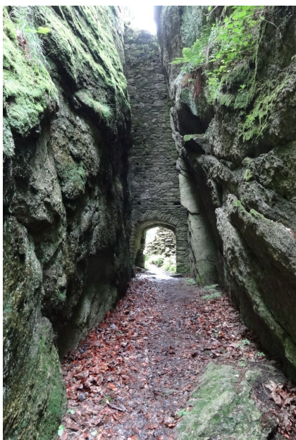
Small gate on the outer side of a rocky gorge.