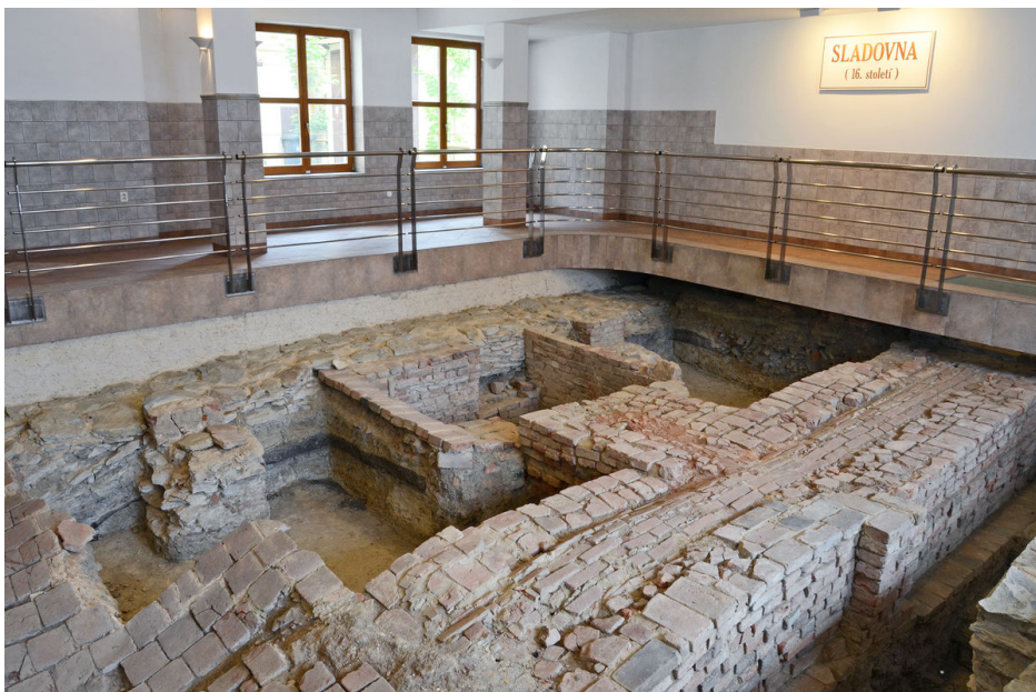
Unearthed foundations of the 16th century malthouse in basement of the municipal office.