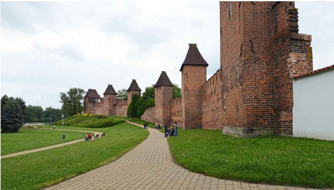
Panorama of the walls of Nymburk.