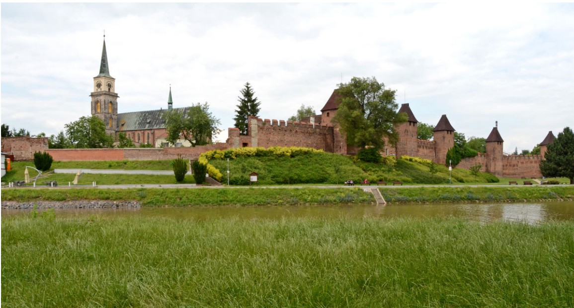
Panorama of the walls of Nymburk, church of St Jiljí in the background.