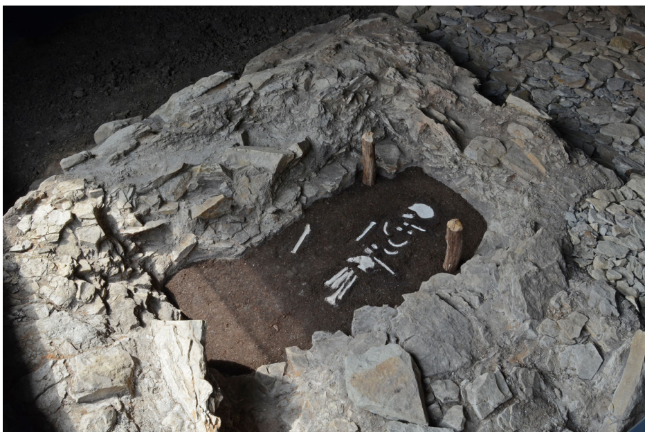
Unearthed stone construction of the barrow with a burial chamber and part of the access ramp.