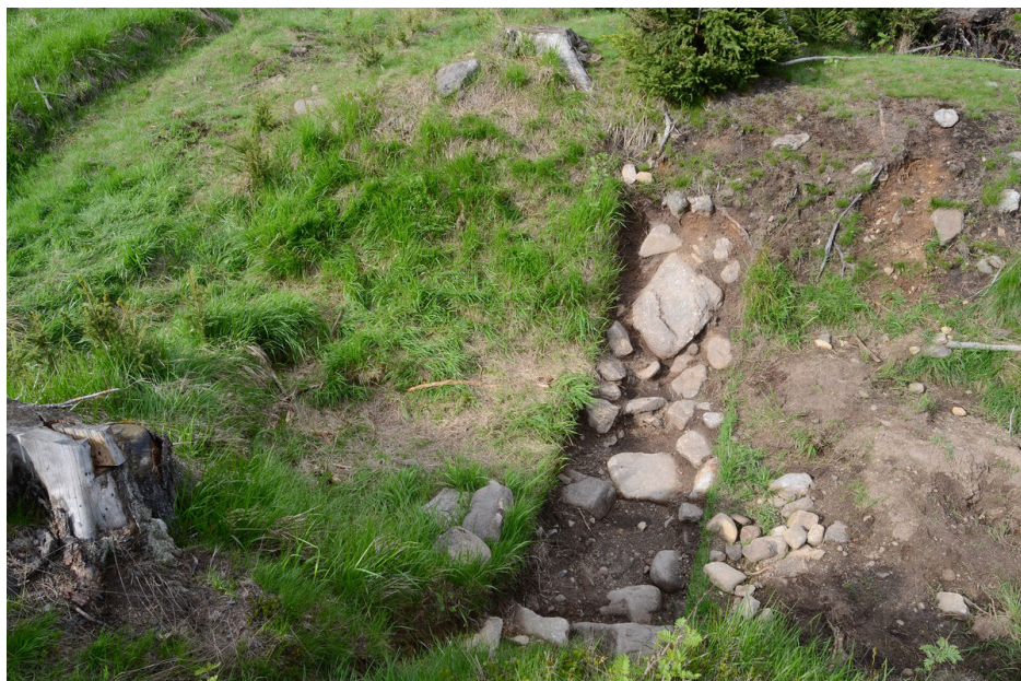
Cross-section of the hollow way.