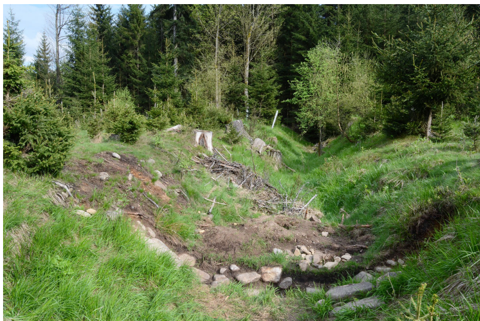
A hollow way between fords across Studenecký and Sklářský Streams.