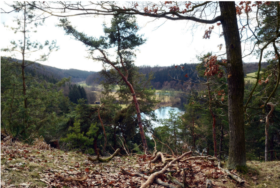
View from the hillfort across the Berounka valley.