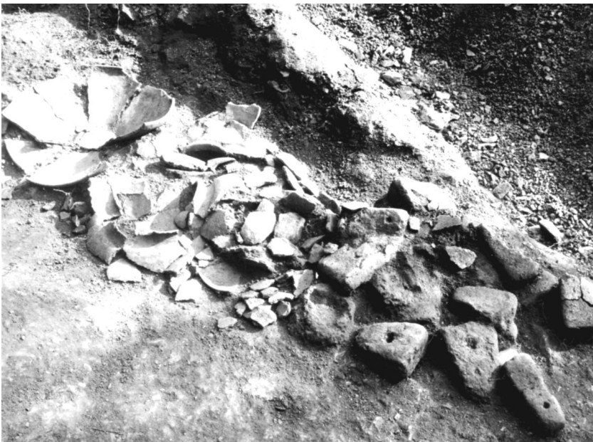
Finds from a house Nr. IV. V. Klein's sxcavations (1934).