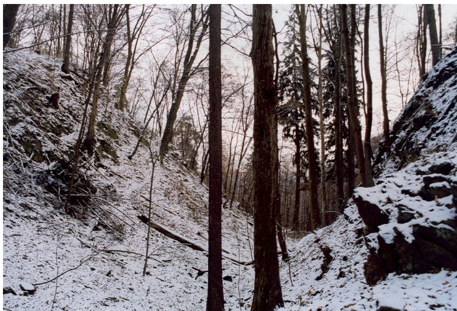
Neck ditch cut into the rocks.