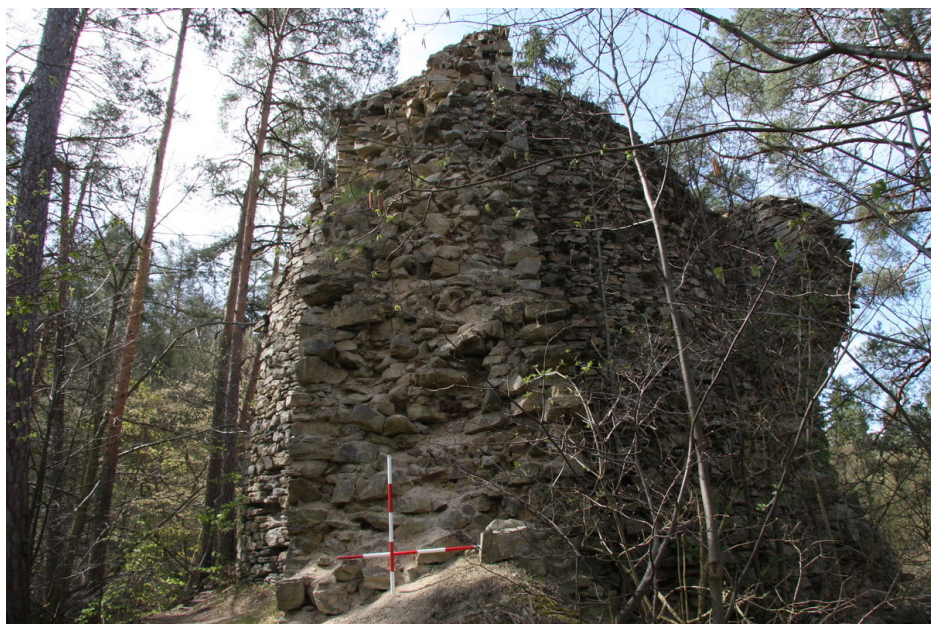
Fragment of the castle tower.