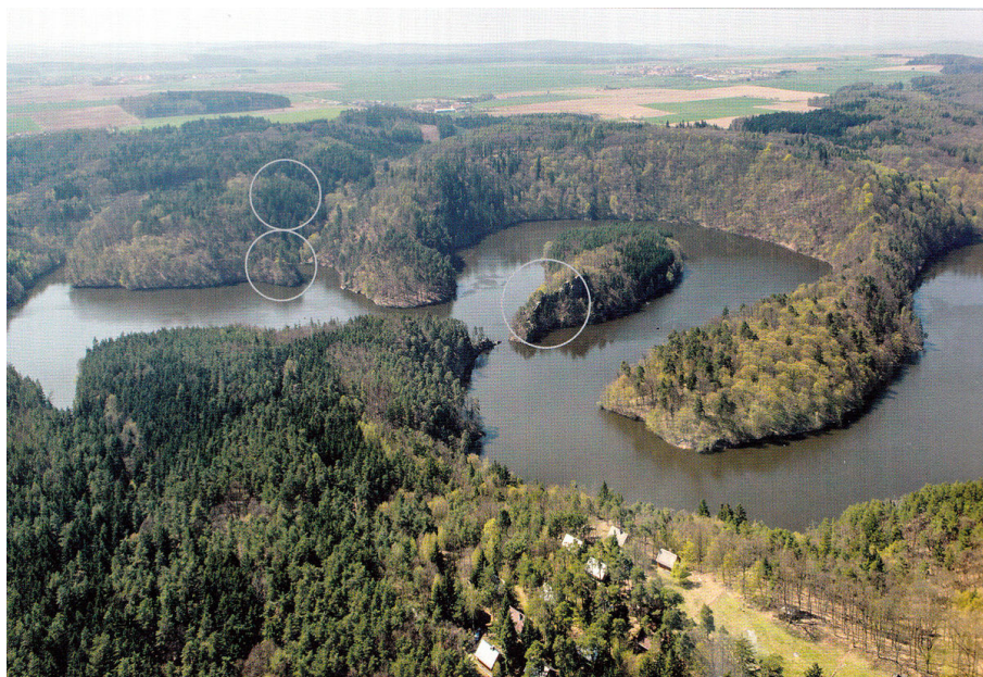
Aerial view of Plešice, Holoubek and Kozlov.