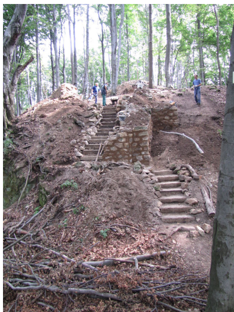
Gateway on the south-western side of the upper ward during the reconstruction; view from the south-east.