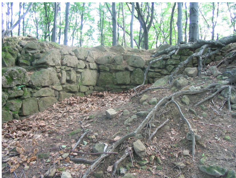
Inner corner of the curtain wall of the upper ward; seen from the south.