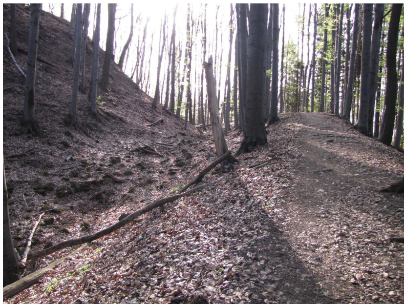
Circular ditch and earthwork of the upper ward; northern part, seen from the east.