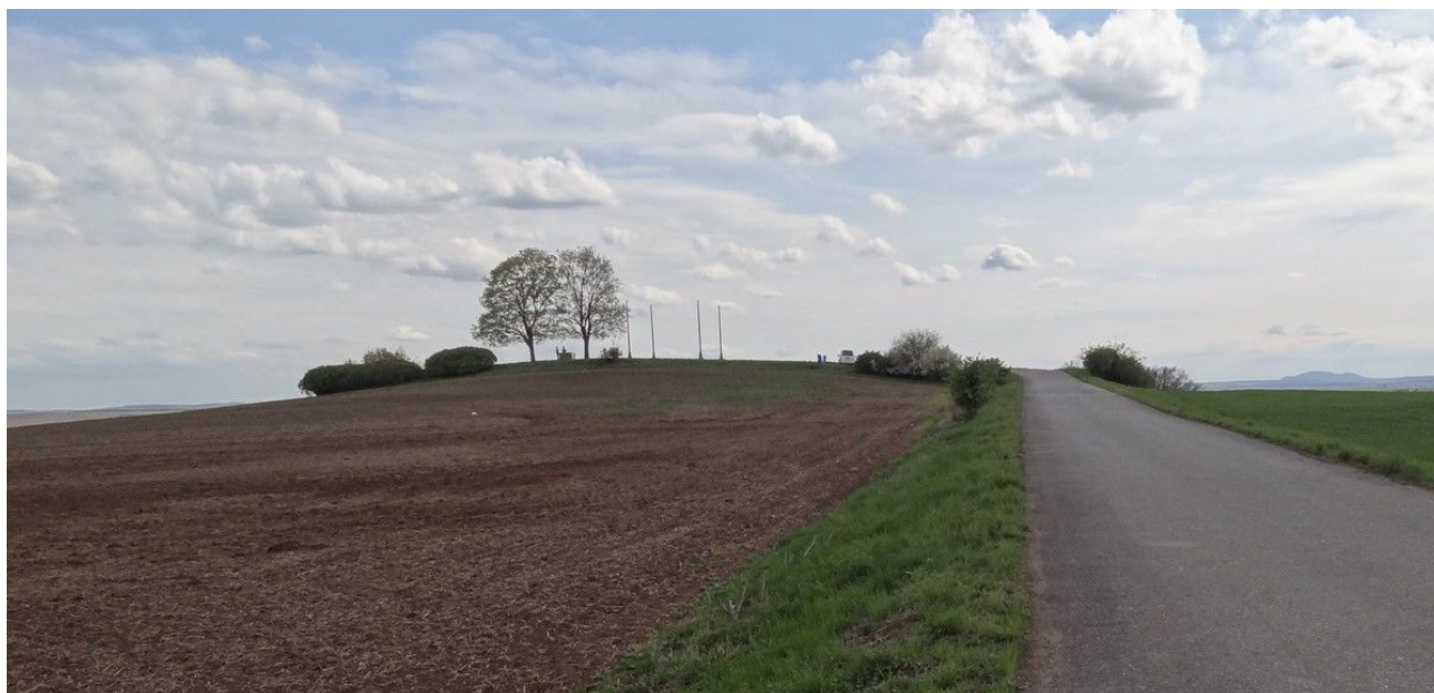
View of the Žuráň barrow; Pavlovské vrchy in the background on the left.