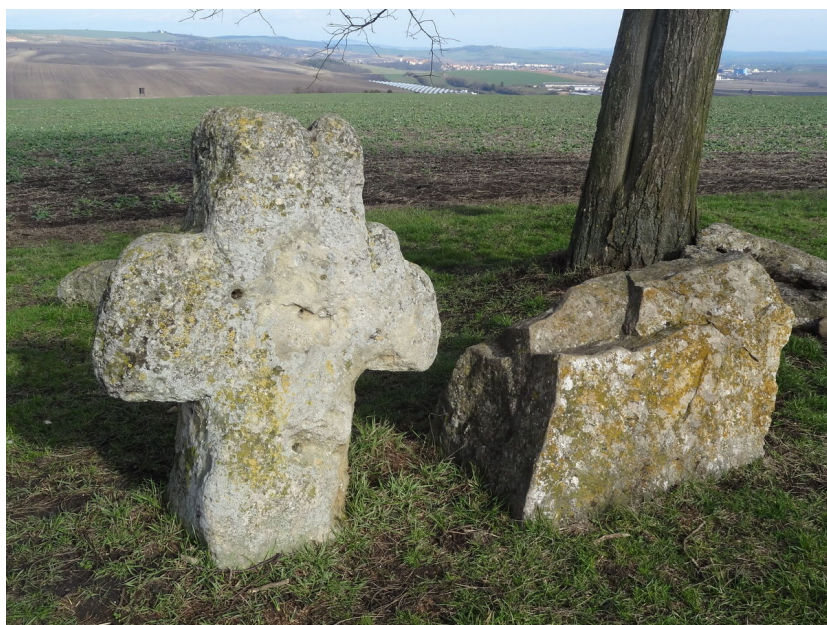
Mass graves and a lookout at a transferred conciliation cross offering a view of the battle field.