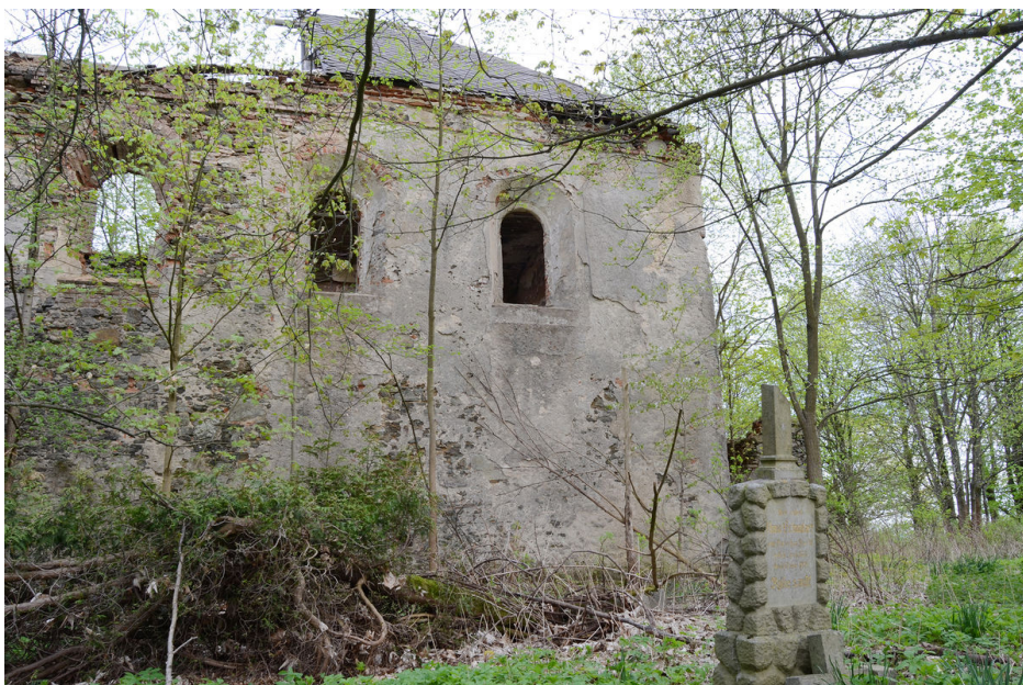
St Anna church.