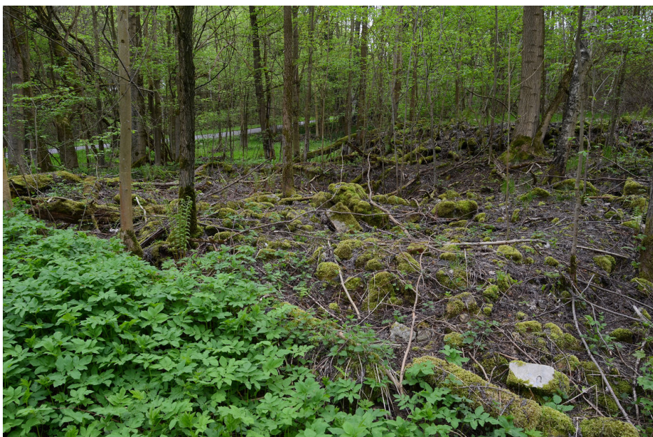
Remains of the former fortified manor.