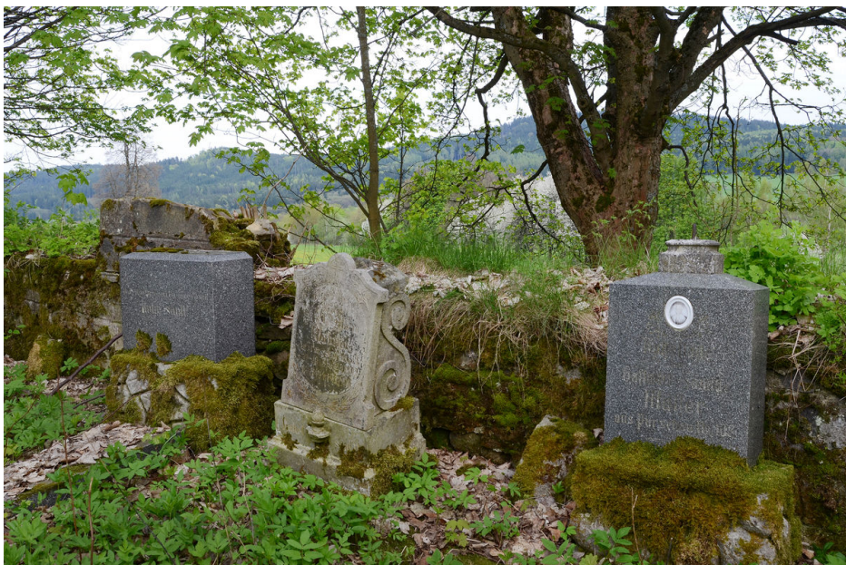
Cemetery at the St. Anna church.