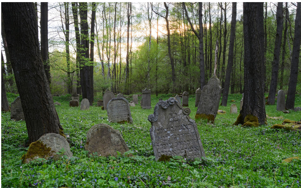
Jewish cemetery in Pořejov.