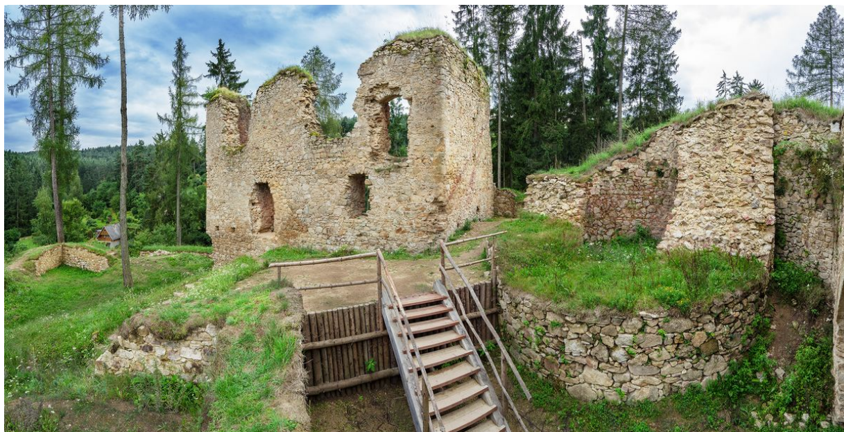
Castle core from north. Wall of the earliest castle palace, ruin of a bergfrit (right).