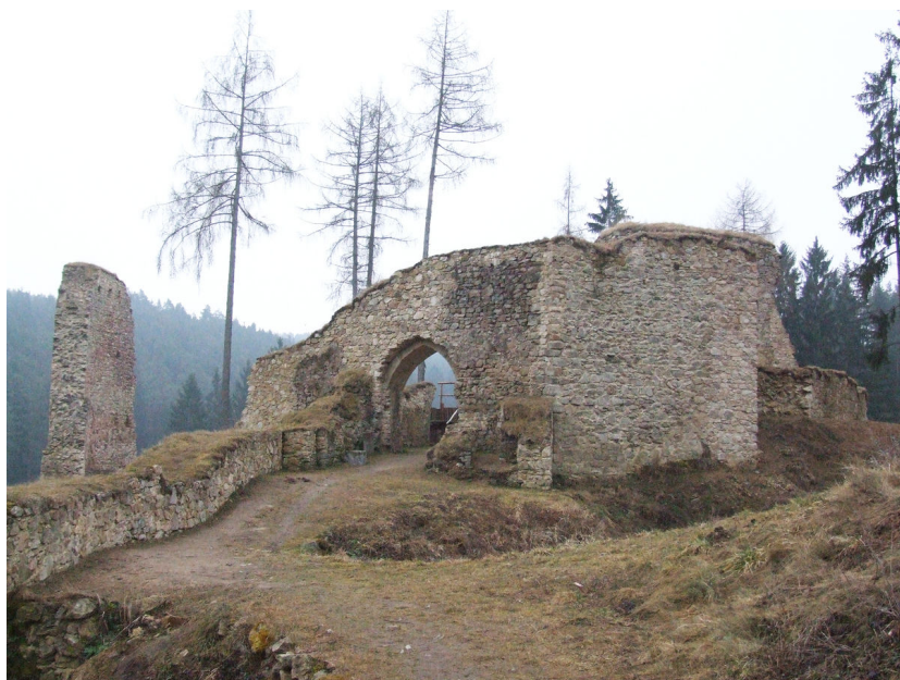
Castle core, taken from north. Photo J. Hložek, 2006.