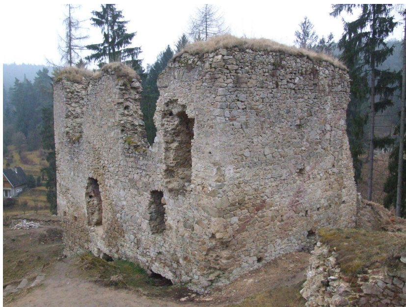
Probably the earliest palace of the castle core.