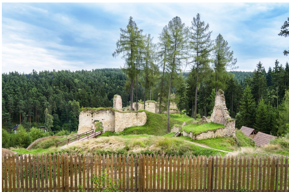
An overall view of the castle.