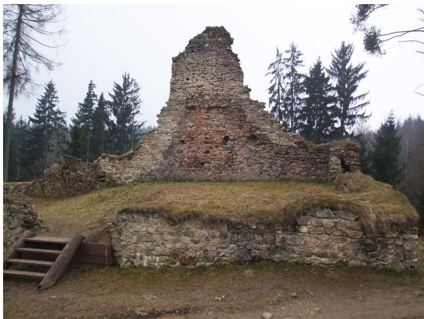
Otisk zateplené komory v prvním patře budovy na prvním předhradí. Foto J. Hložek, 2006.