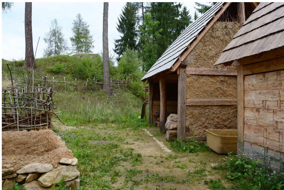
Reconstruction of buildings in museum in front of the castle.