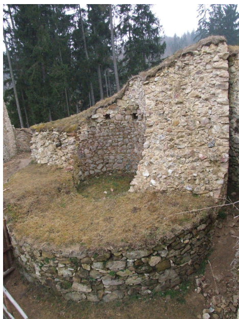
Remains of a bergfrit.